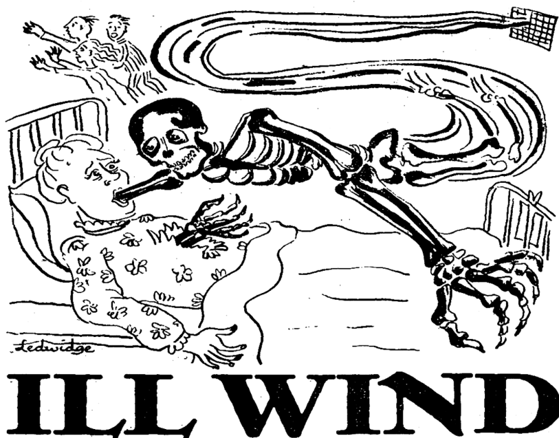
Figure 1: Cartoon illustrating an article in the Observer newspaper on Sunday 11 August 1985, page 19, about Legionnaires' disease following the Stafford Hospital outbreak. The Observer , 1985. Reproduced with permission.

weekend. An infected water aerosol, created in the cooling tower, had entered the fresh air inlet duct and was inhaled by patients, visitors and staff. The danger had been compounded by a basic design and installation fault in the chiller units in the out-patient department, which allowed infected water draining from the roof cooling-tower drip-trays to be sucked into the air coolers serving the department. While presented largely as the man-made disaster, specific environmental conditions had been critical, namely unseasonably high outdoor temperatures, wind direction and humidity levels after the Easter holiday. 62 The outbreak also exposed the potential risk to employees, with 304 staff, nearly a third of those tested, showing evidence of having had a mild form of Legionella infection. 63