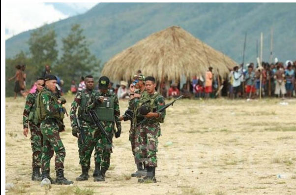
TNI troops in Nduga in January 2019, with a Papuan hut (honai) and local community in the background.