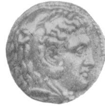
A silver tetradrachm of Alexander the Great,