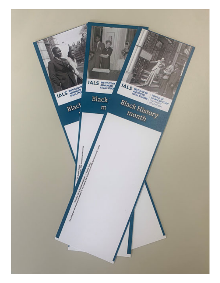
Bookmarks created by library staff to mark Black History month

Since around 2015 and the dawn of the call for social justice brought about by student protests in South Africa focusing on the cost of higher education (#FeesMustFall), decolonisation and underrepresentation, academic libraries have been slowly responding to changes of focus in this area within the higher education sector. Although work addressing issues around inequities based on race,