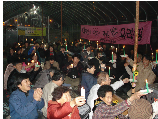
Farmers and supporters vigil, Pyongtaek

In South Korea, bloody battles between civilian protesters and the Korean military were waged in 2006 in response to US plans to relocate the troops there. In 2004, the Korean government agreed to US plans to expand Camp Humphries near Pyongtaek, currently 3,700 acres, by an additional 2,900 acres.