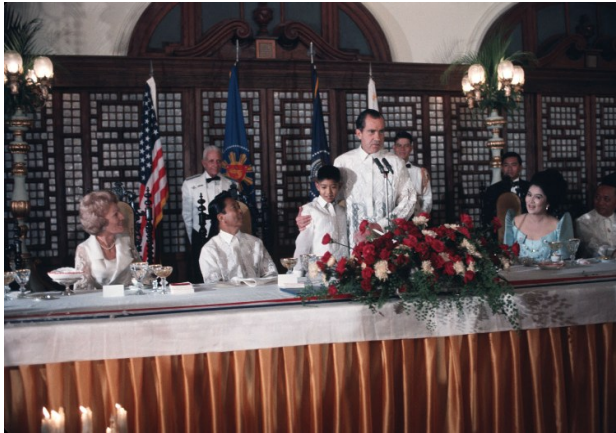
Marcos and Nixon