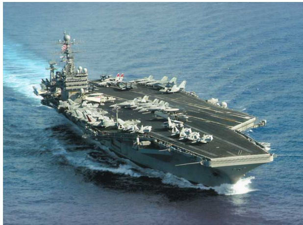
US Aircraft Carrier in the Persian Gulf

. . . demonstrates that military 'security' alone is never enough. It may, over the shorter term, deter or defeat rival states....[b]ut if, by such victories, the nation over-extends itself geographically and strategically; if, even at a less imperial level, it chooses to devote a large proportion of its total income to 'protection,' leaving less for 'productive investment,' it is likely to find its economic output slowing down, with dire implications for its long-term capacity to maintain both its citizens' consumption demands and its international position (Kennedy 1987:539).[5]