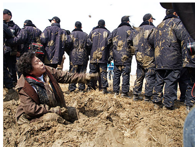
Korean farmer resisting police eviction to make way

The surrounding area, including the towns of Doduri and Daechuri, was home to some 1,372 people, many elderly farmers. In 2005, residents and activists began a peace camp at the village of Daechuri. The Korean government eventually forcibly evicted all from their homes and demolished the Daechuri primary school, which had been an organizing center for the resisting farmers.