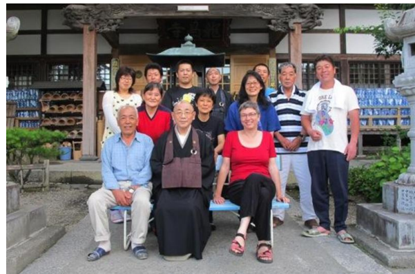
The author and some of her project collaborators at Ryūshōji.