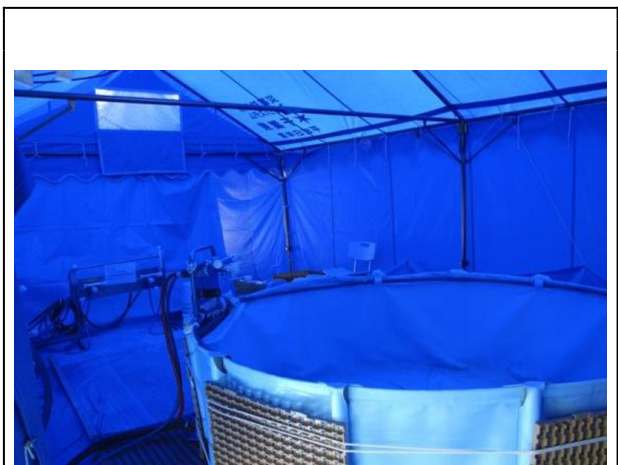
The public bath at Minami Elementary, sponsored by Chiba Prefecture.

Shirano strongly felt that showing off a made-up face, something that would be expected under normal circumstances, at the area of destruction was an affront to all the people who had become victims of the tsunami. In other words, sharing dirty conditions had become a source and a sign of shared suffering and understanding, of community and solidarity.