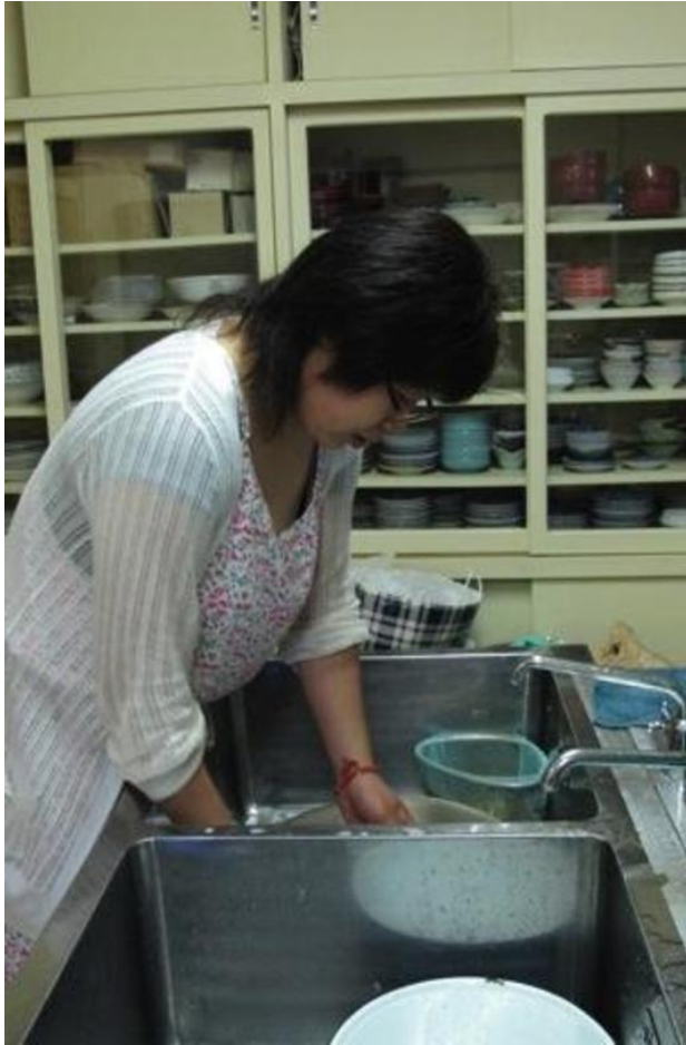
Cleaning the kitchen and dish-washing is women's work.