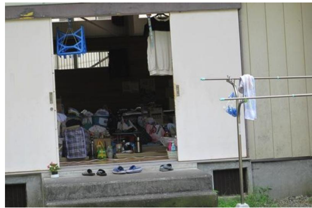
The sports hall of Minami Elementary seen from the back entrance.

significance of this fact in a forthcoming book on shelter-life; for the purpose of this article I would like to emphasize its methodological consequences, as it complicates the reconstruction and interpretation of events, while some of the gaps cannot be filled.