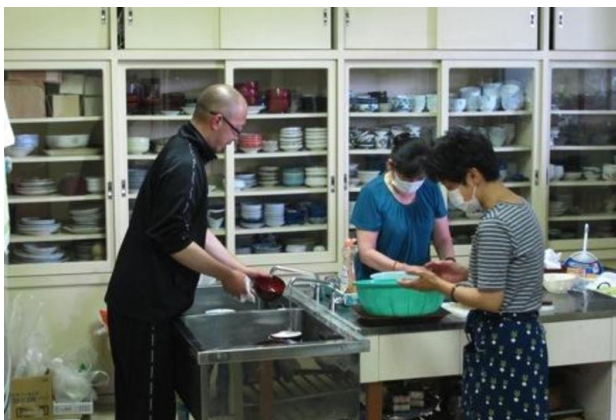
... but today the young monk has overslept and only arrived at breakfast at 6.30 a.m. The women decided that he must be

educated by having him doing all the dishes alone.