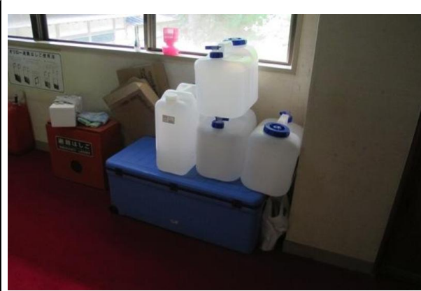
Water canisters at Ryūshōji. No longer in use, but always in reach.