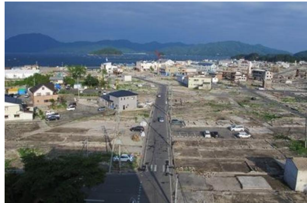
Yamada in July 2011