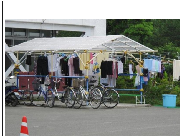
Laundry in front of the hinanjo at a prefectural youth house ( seishōnen no ie ) in the south of Yamada.

measures to be taken to maintain privacy. Increasing cleanliness and order also meant an increasing social differentiation.