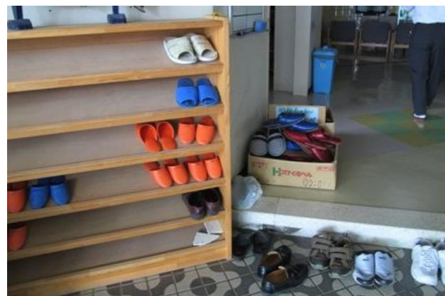
Shoes and slippers outside a prefectural youth house in the south of Yamada that functions as both a school and a hinanjo .