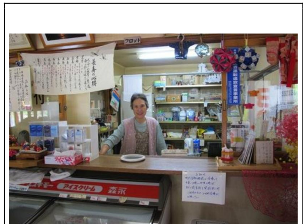
The owner of Shimada kosen at the counter of her bath house.