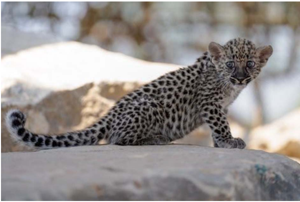
Female Arabian leopard Panthera pardus nimr cub born at the Wild Mammal Breeding Centre, Muscat, Oman on 15 February 2023.

in 2022 by a female from the Breeding Centre for Endangered Arabian Wildlife in Sharjah, United Arab Emirates. On 15 February 2023 she gave birth to the centre's first cub in 26 years. The female cub provides new hope for the survival of this Critically Endangered leopard in Oman and across Arabia, as both the wild and captive populations of this subspecies are very small. In addition, as the sire of the cub is a wild-caught Arabian leopard, she may contain some valuable genetic material that can be used to increase the genetic diversity of the captive Arabian leopard population across the region.