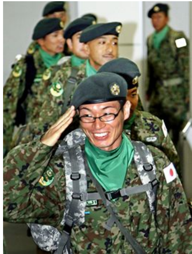
SDF forces deployed to Iraq

to defend the constitutionality of the mission.