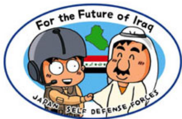
SDF charm offensive in Iraq. This image appeared on

Tokyo has since stepped up its cooperation with Washington, from missile defense to the realignment of U.S. forces. 'It shows that Japan and the United States got closer because of the decision to send the SDF to Iraq,' says a senior Foreign Ministry official.