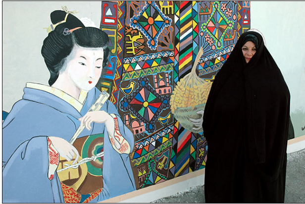
Japan hired Iraqis to renovate the Samawa Secondary School for Girls and provided a mural

The total amount of money that Japan spent on Iraqi reconstruction is impressive. Tokyo pledged US$1.5 billion in grant aid and US$3.5 billion in loans at the Madrid Conference of October 2003. Since that time, MOFA has been announcing various projects on which this money would be spent. MOFA says that the US$1.5 billion in grants has already been completely distributed, and that in fact an additional US$105 million in emergency grant aid was provided to Iraq over the course of 2007 (see Shingetsu Newsletter No. 529). Beyond all of this, Tokyo has pledged to forgive 80% of Iraq's debts from the Saddam Husain era, which totaled about US$7.6 billion (see Shingetsu Newsletter No. 123). I'm not an economist, but I wouldn't be surprised to learn that the real cost of the Iraq adventure to the Japanese taxpayer is now well over US$10 billion.