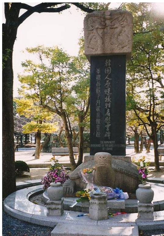
Memorial for the Korean victims of atomic bombing in Hiroshima