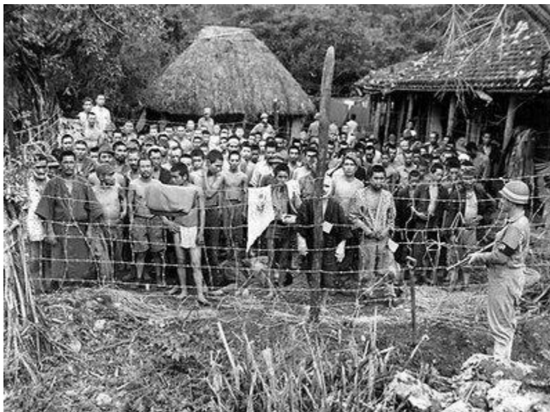
A Marine guards Japanese prisoners of war after the Battle of Okinawa. More than 148,000 civilians died in the campaign.

The extreme fear of “brute Americans and British” [cultivated by the Japanese military] was a factor that made people choose death. Japanese military experiences of slaughter of Chinese people on the continent since the “Manchurian Incident” was widely discussed; and about the fate of residents at large at the time when the war turned out to be a “losing battle”, people despaired anticipating plunder, violence, slaughter by the American military. There were returned migrants who thought “the American military can no way be expected to kill residents”, but returnees were regarded as suspected spies and hence were unable to speak positively. To make such a statement was to court denunciation as a spy and slaughtered.