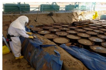
Worker with radioactive waste at Hanford

In the Hiroshima and Nagasaki studies, by contrast radiation exposure was estimated on the flimsiest of guesswork. The radiation emitted by the bombs was calculated according to tests done in the Nevada desert and was recalculated several times in subsequent decades. Researchers asked such questions as, where were you standing in relation to the blast, what was between you and it, what had you had for breakfast that morning, assuming that the survivors would give