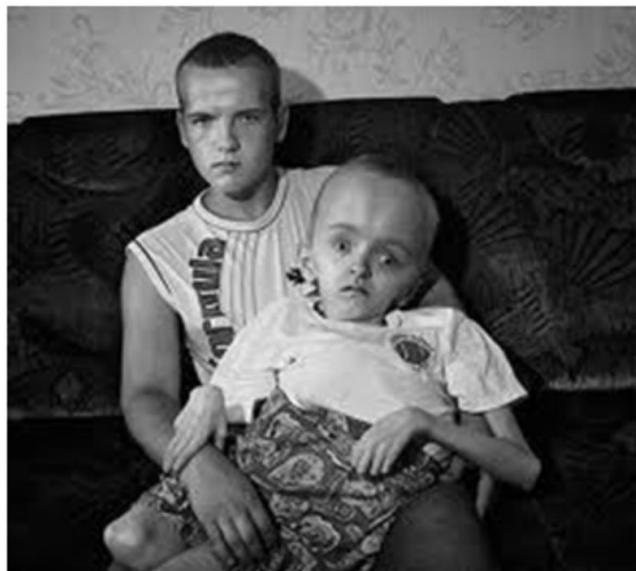
After Chernobyl.

Parallels between Chernobyl and Hiroshima are striking: data collection was delayed, information withheld, reports of on-the-spot observers were discounted, independent scientists were denied access "The USSR authorities officially forbade doctors from connecting diseases with radiation and, like the Japanese experience, all data were classified." With the "liquidators," as they're called, the 830,000 men and women conscripted from all over the Soviet Union to put out the fire, deactivate the reactor, and clean up the sites, "It was officially forbidden to associate the diseases they were suffering from with radiation." "The official secrecy that the USSR imposed on Chernobyl's public health data the first days after the meltdown... continued for more than three years," during which time "secrecy was the norm not only in the USSR, but in other countries as well."