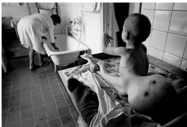
Chernobyl legacy.

But the parallels are political, not biological, for the Hiroshima data have proven to be an "outdated" and useless model, as Stewart said, for predicting health effects from low-dose, chronic radiation exposure over time. The Hiroshima studies find little genetic damage in the survivors, yet Yablokov et al. document that "Wherever there was Chernobyl radioactive contamination, there was an increase in the number of children with hereditary anomalies and congenital malformations. These included previously rare multiple structural impairments of the limbs, head, and body," devastating birth defects, especially in the children of the liquidators. The correlation with radioactive exposure is so pronounced as to be "no longer an assumption, but... proven," write the authors. As in humans, so in every species studied, "gene pools of living creatures are actively transforming, with unpredictable consequences": "It appears that [Chernobyl's irradiation] has awakened genes that have been silent over a long evolutionary time." The damage will play out for generations — "at least seven generations."