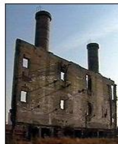
Remains of one of Unit 731's germ factories in Manchuria serve as a reminder of the atrocities that took place during Japan's occupation of China during World War II

During the 1981 burst of publicity, Justice B.V.A Roling, a Dutchman and the only surviving judge from the International Military Tribunal for the Far East in Tokyo, Asia's Nuremberg, complained that no word about biological warfare had been offered in evidence. He wrote: "It is a bitter experience for me to be informed now that centrally ordered Japanese war criminality of the most disgusting kind was kept secret from the court by the U.S. government."