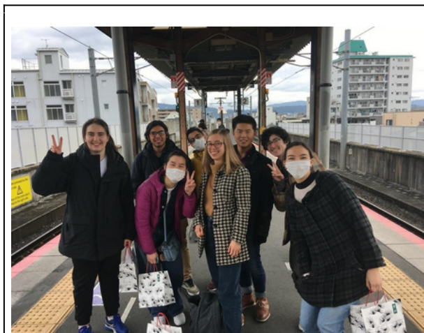
Students in our class on our way to the Liberty Human Rights Museum in Osaka.

2. Stigma and discrimination. A second parallel emerged in the course of our field trip to the Osaka Liberty Human Rights Museum to see their exhibits on Minamata Disease. While class discussions about societal discrimination against Minamata Disease victims were fresh in our minds, we saw discrimination growing alongside the spread of the coronavirus. Students brought up COVID-related discrimination in and outside of class. Some vented about comments they heard around them, disturbed by apparent anti-Chinese sentiment. 21 Others shared their discomfort watching the news on Japanese TV, for example when a segment showed an unruly group of Chinese at an airport, followed by interviews with Japanese citizens who voiced what they found displeasing about Chinese tourists. As a class, we reflected on what discrimination would do to the virus's spread. The stigma associated with Minamata Disease caused some to hide ill family members out of fear of being ostracized. To avoid being stigmatized, would people with COVID-19 symptoms hide their coughs with medications instead of getting tested? If they did, stigma could result in worsening infection rates. Discrimination