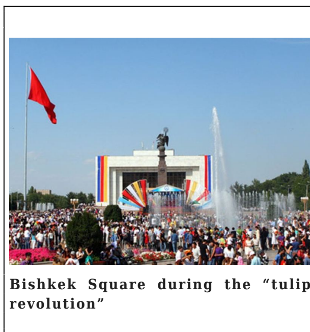
Bishkek Square during the "tulip revolution"