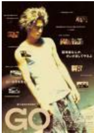
Go: Kaneshiro Kazuki's best-selling novel was made into an award-winning film, providing a fresh image of Zainichi

In Kaneshiro Kazuki's Go (2000), the protagonist, Sugihara, opens the novel with a description of his communist, North Korean father, the Japanese colonization of Korea, and the family's desire to visit Hawaii—a vacation that requires switching their nationality from North Korean to South Korean (and shifting their membership from North Korea-affiliated Soren to South Korea-affiliated Mindan). The stuff of the novel's first five pages has been recounted countless times by Japanese and Zainichi writers, but no one would have imagined that it would make a best-selling novel. Reciting Bruce Springsteen's "Born in the U.S.A."—though observing that Springsteen grew up in a poor family whereas his family is well-off—Sugihara sings his own refrain of "Born in Japan." At once erudite and violent, he is highly individualistic and antiauthoritarian; he is the proverbial nail that should have been hammered in. In the 1960s and 1970s, Zainichi was all seriousness and suffering: as the pejorative slang would have put it, "dark" [ kurai ]. The unbearable burden of Zainichi being traumatized, Zainichi life-course and discourse. Instead, Kaneshiro's prose and protagonist exemplify a striking mode of being cool [ kakkoi ] in contemporary Japanese culture.