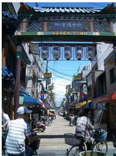
Koreatown in Osaka