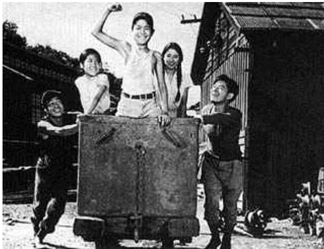
From the film of Nianchan

“pure”. Yet it is nonetheless surprising to find a systematic effacement of the best-selling postwar book by a Zainichi author.