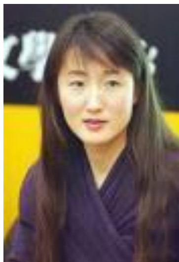
Yu Miri: a best-selling author and a figure of controversy

Yu characterizes herself as a runaway [ toposha ], as someone who flees not to hide but simply to run away. Her adolescence—though common enough among adolescents—is a series of shameful, embarrassing moments and memories. She is ashamed of her aunt, whom one of her friends mistakes for a beggar, as well as the meager lunch she takes to school. She is troubled by her mother taking up a lover and abandoning home for days at a time. Enrolling in a prestigious middle school at her mother's request, she merely yearns to leave. Although she finds friends from time to time, she feels closer to dead writers than to any living people. "I was closer to the dead than to the living. In my bag were books by [the poet] Nakahara Nakaya and [the novelist] Dazai Osamu, and I could only talk easily with the dead. The living inevitably hurt me, but the dead forgave and cured me." She develops a crush on a classmate but is rebuffed: "I don't know what I wanted from her. It was not to become closer or to touch her body or to be touched. Thinking about it now, perhaps I was inviting her to die with me." She "woke up every morning