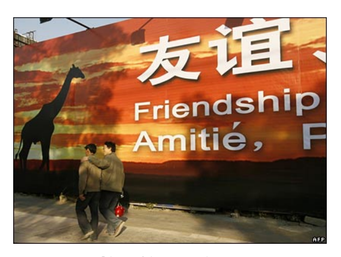
China-Africa summit 2006

China's total trade with African countries came to 73.5 billion dollars in 2007. Total trade between Japan and Africa was 26.6 billion dollars in 2007. "This conference has been assisting African countries since 1993. As this year's host, we wanted to be more competitive than China," a government official said.