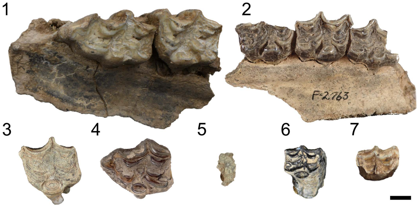
Figure 6. Equids from McKay Reservoir: (1–5) Cormohipparion sp. indet., upper dentition: (1) left maxilla fragment with P2–P3 in occlusal view (UWBM VP 61653); (2) right maxilla fragment with P2–P4 in occlusal view (UOMNH F-2763); (3) left upper cheek tooth other than P2 or M3 in occlusal view (UOMNH F-2787); (4) left upper cheek tooth other than P2 or M3 in occlusal view (UWBM VP 61573); (5) left upper cheek tooth fragment in occlusal view (UOMNH F-4156); (6) Pseudhipparion sp. indet., right upper cheek tooth other than P2 or M3 in occlusal view (UOMNH F-29959); (7) Equinae gen. indet. sp. indet., buccal half of upper cheek tooth other than P2 or M3 in occlusal view previously assigned to Neohipparion (UOMNH F-4444). Scale bar = 1 cm.

with the species means of previously described species (Table 3). Furthermore, for specimens with multiple teeth, the most similar species varied with tooth position. UOMNH F-2787 is most comparable in size to Cormohipparion skinneri but is still fairly far off. The dimensions of