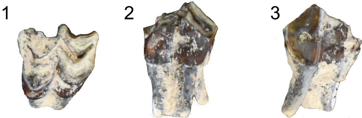
Figure 5. Dromomerycidae gen. indet. sp. indet. from McKay Reservoir, left M1 or M2 (SDSM 38459): (1) occlusal view; (2) medial view; (3) lateral view. Scale bar = 1 cm.