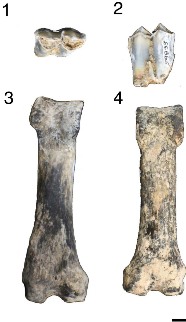
Figure 4. Pleiolama sp. indet. from McKay Reservoir: (1, 2) right m1 or m2 (SDSM 59835): (1) occlusal view; (2) lateral view; (3, 4) proximal phalanges in plantar view: (3) UOMNH F-81112; (4) UOMNH F-4154. Scale bar = 1 cm.

removing the occurrence of Neohipparion from the faunal list for McKay Reservoir.