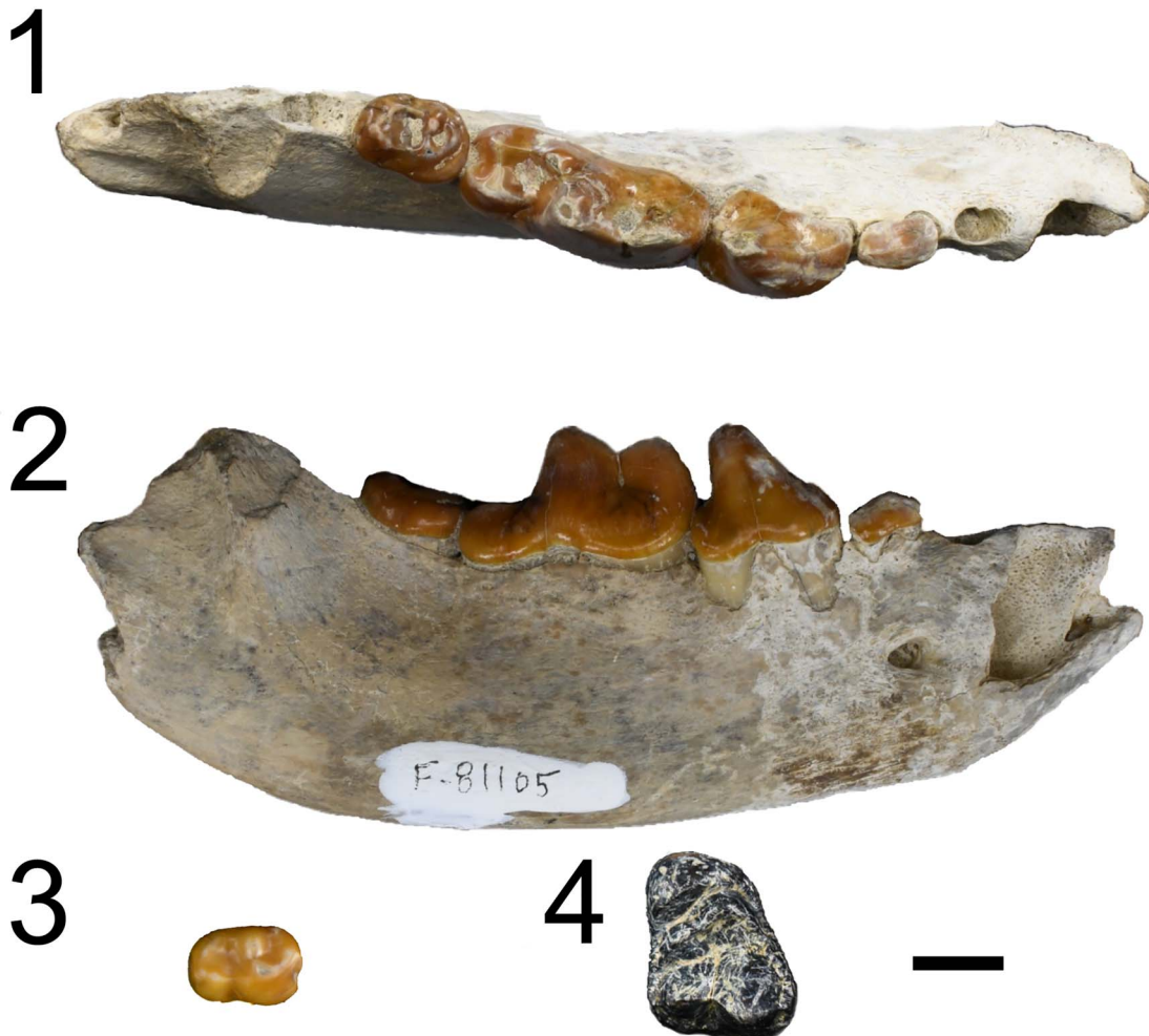
Figure 2. Borophagus secundus (Matthew and Cook, 1909) from McKay Reservoir: (1, 2) right dentary (UOMNH F-81105): (1) occlusal view; (2) lateral view; (3) right lower m2 (UOMNH F-81106); (4) left upper M1 in occlusal view (UOMNH F-29746). Scale bar = 1 cm.

Description. —Large size of teeth and presence of small m2 on UOMNH F-81105 and F-81106 suggest that specimens can be