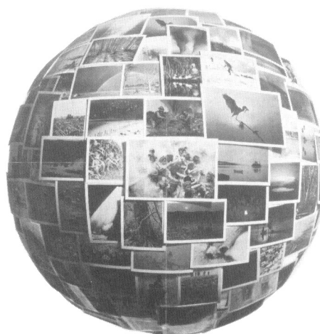
FIG. 1. Photo collage of winning photographs from the 1991–92 competition.