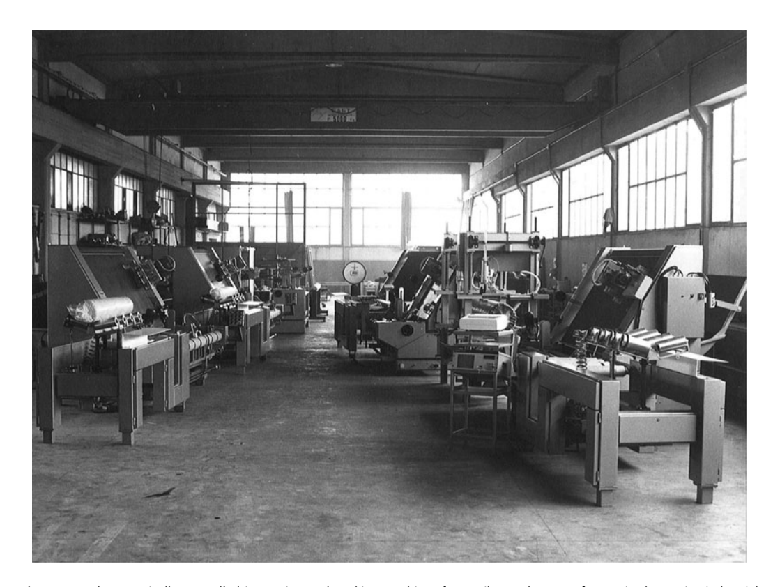
Figure 1. Early numerically controlled inspection and packing machines for textiles at the Testa factory in the Zanica industrial district north of Milan, 1969.

As the economic sociologist and centre-left politician Carlo Trigilia wrote, 'The advantages that small firms accrue may be synthesised by the word elasticity ( elasticità ), a term that signifies many things in this case: the ability to rapidly shift models, to be free from rigid technology, to be able to count on a minimally bureaucratised system, easy internal communication, and ready finance'. <sup>26</sup> In Italy, industrial districts employed these varied senses of 'flexible' and 'elastic', developing an enormous excess capacity to produce standardised goods; and by the 1970s, they managed to resolve this surplus by swimming up-market, offloading luxury exports to international markets, leading to the 'Made in Italy' effect where high quality items were produced within zones designated for historic craft traditions, often in collaboration with the emergent figure of the 'designer'. <sup>27</sup>