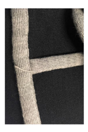
Figure 10. Details of a frock from Rimoldi by Nanni Strada, Summer 1984 Collection. Designed for production at the MPO-VVT factory in Moscow. Milan Triennal. © Nanni Strada. Courtesy: Nanni Strada Archive.

for light industry'. The exhibition did not merely exhibit the latest fashions therefore, but the machines at work, presenting how 'simple, elegant clothing' could be knitted quickly and inexpensively with Soviet materials: 'At Rimoldi, we knew the Soviets wanted to renovate their machines . . . at this symposium, we could cut through the red tape and just show them what the equipment does', Strada recalled. The pieces of Strada's line were meant to be combined in different ways to produce a set of standard outfits. 'After we made the prototypes for the collection, we wrote out the directions for how to produce them alongside photographs of the clothing as it is meant to be worn, and a videomanual'. During the symposium, official evaluators tried to tear the garments apart, and if they withstood this trial they put them on. Strada's clothing proved durable enough. Rimoldi installed its