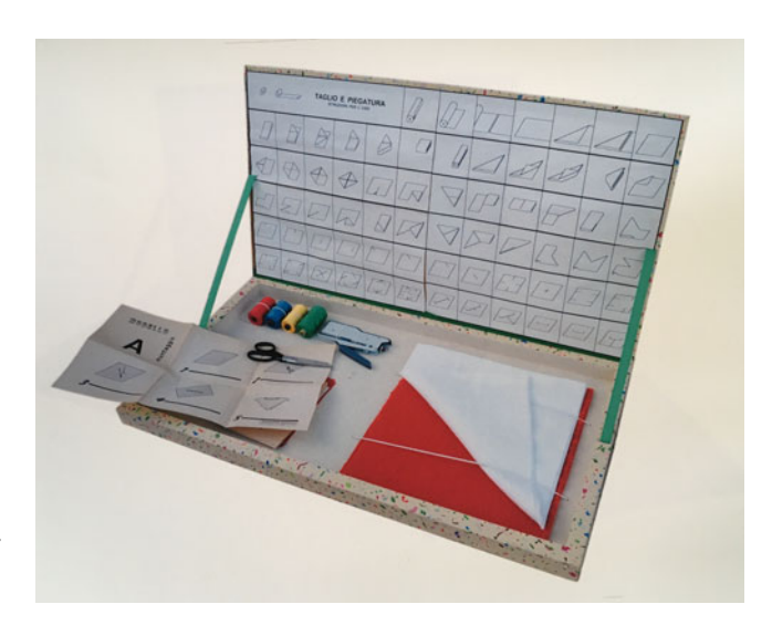
Figure 8. Archizoom Associati, Dressing is Easy domestic assembly kit, 1973.

At the Fifteenth Triennale, while Strada exhibited Il Manto e la Pelle , Archizoom presented the film How Gogol's Overcoat is Made (1973). Adapting Nikolai Gogol's famous short story, The Overcoat (1842), about a poor clerk's misadventures in acquiring and losing a beautiful cloak, their film satirised its sponsor, Facis, the historic clothing brand of the Turin-based Gruppo GFT, the world's largest manufacturer of name-brand luxury clothing. Archizoom explored how Italy's giant clothing firms had difficulty keeping up with fashion cycles due to their economies of scale and fixed output. <sup>43</sup> Referring to district level production, they argued that the 'flexible and pliable quality of the fashion industry' revealed how the market continually adapted to new methods of production. In large