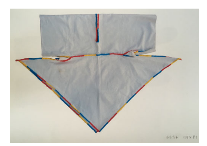
Figure 7. Archizoom Associati (Lucia Morozzi) apron. Raw cotton, natural white. Colour segmented stitching. Dressing Design prototype, circa 1973.