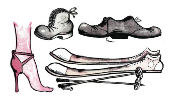
Figure 12. V. Panfilova, untitled illustration for Krokodil , 1982.

packaging to Soviet manufacturers. The story was accompanied by an illustration of accidental footwear made from the errors of domestic suppliers: stilettos with no soles, Oxfords joined at the heel, boots whose laces are tied up past the tongue, leaving no room for feet to enter, and tennis shoes of an absurd length (Figure 12). The story and illustration raised concerns about 'debased adaptation', the anachronistic class-imaginaries of Western European leftists, the Russian public's commodity fetishism as it opened its borders, all while deflating the minister of light industry's speculative pronouncements, whose promises of providing high-quality goods became a crisis of production and consumption where Soviet workers are left deskilled and the goods themselves ruined: 'crease-resistant' ends up 'soft boiled'. 64