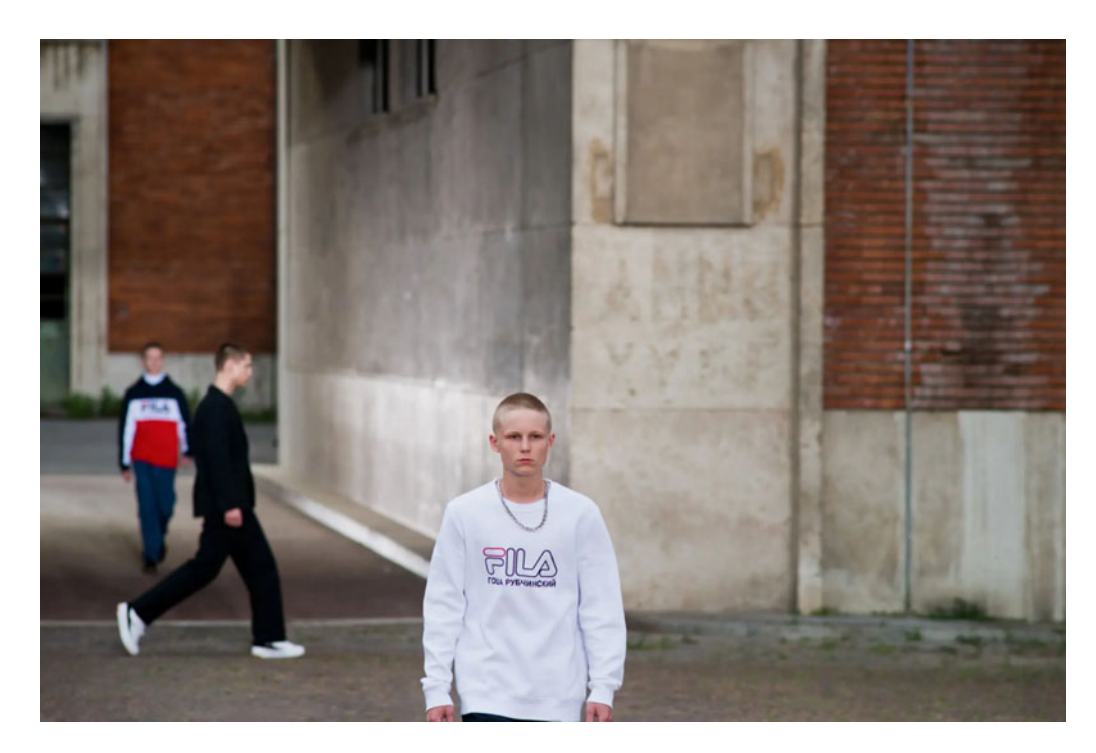
Figure 13. Gosha Rubchinskiy, Spring 2017 Men's Wear Collection presented during Pitti Uomo at the Manifattura Tabacchi, 2016.