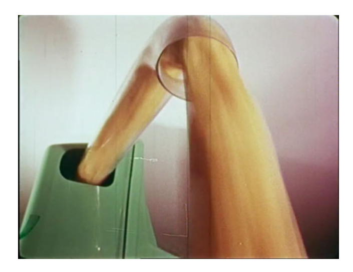
Figure 3. Yellow cotton-nylon fabric shooting out of a Calza Bloch pneumatic tube. Il Manto e la Pelle (film).