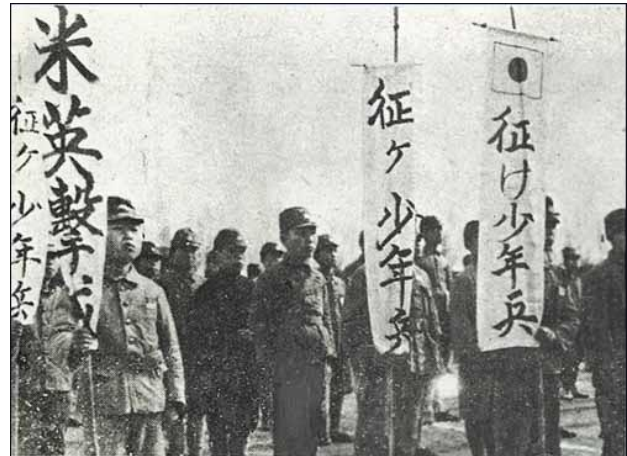
Korean youths conscripted by the Japanese authorities in the last years of the Pacific War

Conscription, first applied to Korean subjects of the Japanese Empire by Japanese colonial authorities in 1943 (promulgated March 1, effective August 1), was reintroduced soon after the establishment of the post-colonial Korean state on August 15, 1948. The first Military Duty Law ( pyōngyōkpōp ), promulgated on August 6, 1949, drew largely on colonial precedents and continental European (German and French) models, putting all male citizens under the age of 40 under service obligations, requiring those whose obligations were unfulfilled to return from sojourns abroad before reaching the age of 26 (and prohibiting anybody above this age from traveling abroad until fulfillment of the service obligations). Exceptions were only made for those declared medically unfit, criminals, or delinquents. 26 In anticipation of the coming all-out conflict with the competing regime in the Northern part of the peninsula and wishing to “consolidate” the militaristic nationalist platform and crush discontent among citizens at official corruption and the dire socio-economic situation, the Syngman Rhee regime began from an early point to militarize the schools as well: on December 26, 1948, regular military exercises were introduced in all schools above the middle level. 27 In the beginning of the Korean War, on