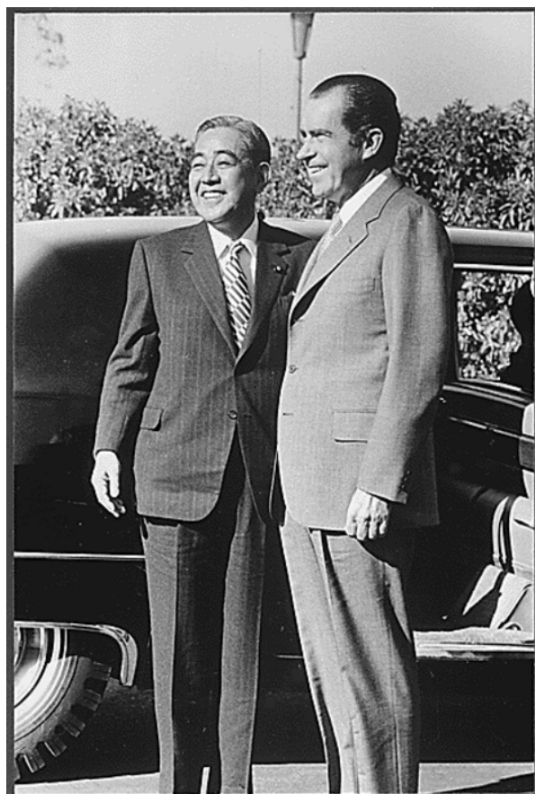
Sato and Nixon, 1972

Following the reversion, Japan from 1978 began to pay regular and continuing sums to subsidize the Pentagon, a peculiar form of “reverse rental” (by landlord to tenant) that came to be known as “ omoiyari ” (sympathy) payment in Japanese and “Host Nation Support” in English. The annual sum grew steadily, from 6 billion yen in 1978 to around 200 billion yen (more than $2 billion) today, with “indirect” items included, Japan’s subsidy in total amounted (according to the US Department of Defense in 2001) to an annual $4.4 billion. 27 Over slightly longer than three decades, it amounts to approximately three trillion yen, roughly 35 billion dollars. 28 That is about three times as much as NATO and about one half of the entire world’s subsidies to maintain the US military presence. Where