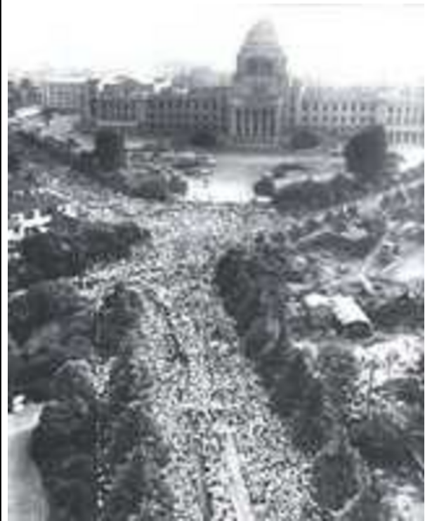
Demonstrators surround the Diet in an attempt to bloc the Ampo Treaty

The 1960 adoption of Ampo was tumultuous. The government at the time was that of the Liberal Democratic Party (LDP), which had been set up in part with CIA funds five years earlier and in character and inclination owed much to American patronage. It was headed from 1957 by Kishi Nobusuke, the US’s preferred agent, who had been installed as Prime Minister in 1957. Kishi rammed the bill through the House of Representatives in the pre-dawn hours on 20 May, in the absence of the Opposition, as protesters milled about in the streets outside.