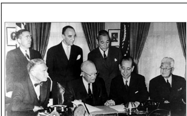
Eisenhower with Kishi and Fujiyama (right)

which Tokyo District Court Justice Date Akio held US forces in Japan to be “war potential” and therefore forbidden under the constitution’s Article 9 (the peace commitment clause). Had the Date judgement been allowed to stand, the history of the Cold War in East Asia would have had to take a different course. At 8 am on the morning immediately following it, however, and just one hour before the Cabinet was to meet, US ambassador Douglas MacArthur 2 nd held an urgent meeting with Foreign Minister Fujiyama Aichiro. 4 He is known to have spoken about the possible disturbance of public sentiment that the judgment might cause and the complications that might ensue. Following that meeting, the appeal process was cut short by having the matter referred directly to the Supreme Court, and MacArthur then met with the Chief Justice to ensure that he too understood what was at issue. In December 1959 the Supreme Court reversed the Tokyo Court judgement, ruling that the judiciary should not pass judgement on matters pertaining to the security treaty with the US because such matters were “highly political” and concerned Japan’s very existence.