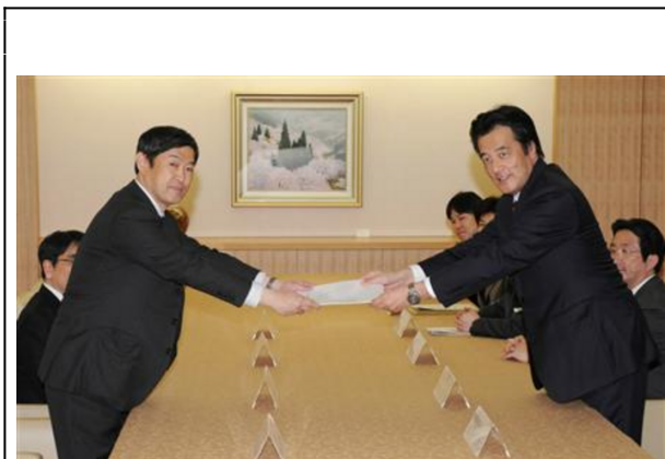
Foreign Minister Okada (right) receives the secret report

2010. 6 They confirmed three main understandings: first what they called a “tacit agreement” of the Government of Japan (January 1960) to turn a blind eye to US nuclear weapons, agreeing that “no prior consultation is required for US military vessels carrying nuclear weapons to enter Japanese ports or sail in Japanese territorial waters;” 7 second, a “narrowly defined secret pact” to allow US forces in Japan a free use of the bases in the event of a “contingency” (i.e. war) on the Korean peninsula; and third, a “broadly defined secret pact” for Japan to shoulder costs for restoring some Okinawan base lands for return to their owners. 8