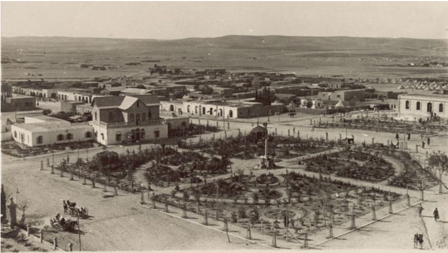
Figure 2. Bir al-Saba' during the Ottoman rule. Library of Congress, American Colony (Jerusalem), Photo Department, 1914–17.