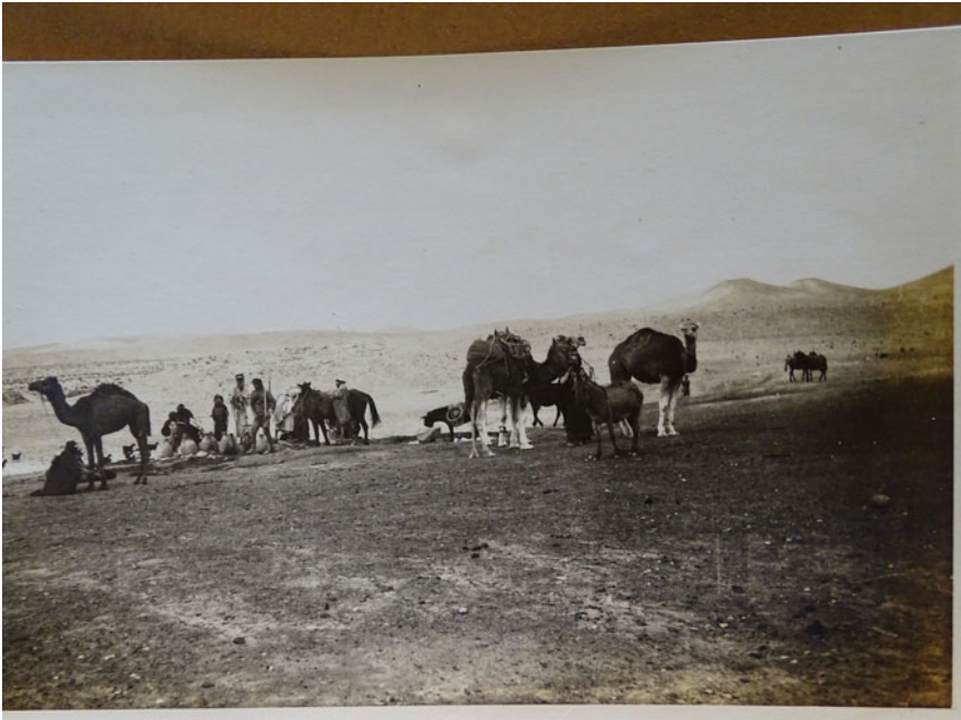
Figure 1. The wells of Tal al-Milh village (Wadi al-Malah-al-Meshash) during the 1880s.

goats, barley, sheep, camels, tobacco and milk products'. 30 There was, in other words, a significant degree of what Peter Taylor calls 'town-ness' here before there was density, city planning or monumental buildings – and there was 'city-ness' at work before there were railroads and the telegraph, materializing Bir al-Saba' as a central connected place of imagined possibilities, mobility and stability. 31