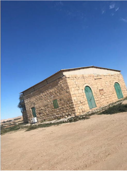
Figure 4. The flour mill of the village of Tal al-Milh (al-Malah) during the British rule in Palestine.

and other Bedouin villages like Tal al-Milh and ‘Ara’ara’ (see Figure 4 ). 127 Saba’awi agency deepened regional economic ties through their purchasing and productive power ‘in the markets of Hebron, Gaza and Bir al-Saba’. 128