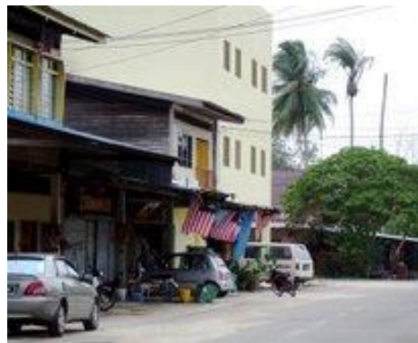
Kampong Hubong was once New Syonan

These days Kampong Hubong is a cul-de-sac on the map of Malaysian modernization. But once, for just two short years between 1943 and 1945, Kampong Hubong was closer to the core of things: a new community called New Syonan that emerged from the conditions of Japan's occupation of Singapore, and acted as a highway for the delivery of imperial Japanese ideology about Asian unity and cooperation.