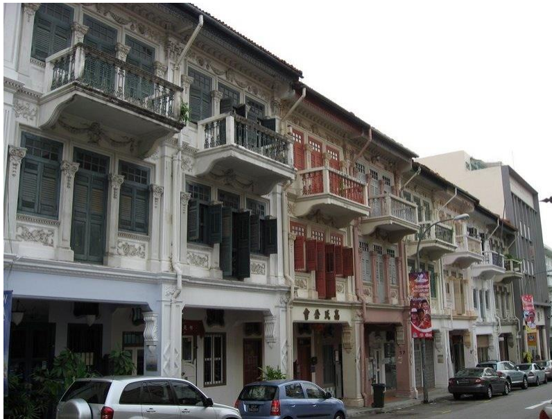
Shophouses on Bukit Pasoh Road where comfort women once worked

British Singapore had been infamous for its sex trade; Japanese rule introduced new elements to the city's existing business of servicing men's sexual desire. The military authorities installed "comfort women" in requisitioned properties and turned them into "comfort stations" at Tanjong Katong Road, Wareham Road, Branksome Road, in the York Hotel, in the Anglo-Chinese School at Cairnhill Road, and in houses at Bukit Pasoh Road. Local Chinese women were the military's first choice and comprised the majority of women forced into sexual servitude, but "comfort stations" in Singapore also included Korean and Indonesian women, as well as some Japanese women reserved for the officers. 2 Lines of Japanese soldiers waiting stolidly for their turn on the bodies of "comfort women" became a common sight. Enterprising local boys gathered up used condoms outside the comfort stations, washed them, put them in bamboo tubes, powdered them, rolled them up and resold them to Japanese soldiers. 3