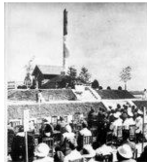
Opening ceremony at Syonan Chuureitou.

The Syonan Chureito, a shrine and memorial dedicated to the war dead on the summit of Bukit Batoh Hill, was a grander affair, memorializing the battle for Singapore. The ashes of Japanese troops killed in the campaign rested here beneath a 15-meter wooden cylinder topped in a rather phallic fashion by a brass cone.