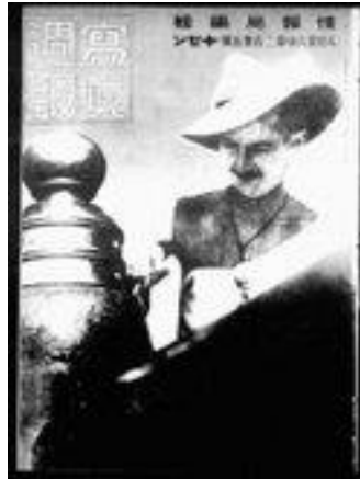
A POW builds Syonan Jinja.