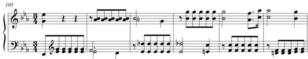
Example 3. Joseph Haydn, Sonata in E flat major HXVI:28/i, bars 105–110, from Six sonates pour le clavecin ou le piano forte , Op. 14 (Berlin and Amsterdam: Hummel, 1778)

clavichord, but he did not necessarily regard that instrument as a desirable or optimal medium for any particular composition.