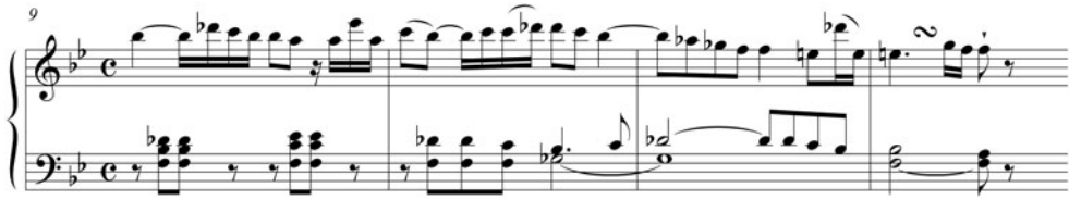
Example 29. Haydn, Sonata in G minor, HXVI:44/i, bars 9–12, from Three Sonatas for the Pianoforte or Harpsichord , Op. 53 (London: Longman & Broderip, c1788)