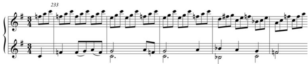
Example 10. Haydn, Capriccio in G major, HXVII:1, bars 233–237, from Œuvres complètes , volume 2 (Leipzig: Breitkopf und Härtel, 1800)