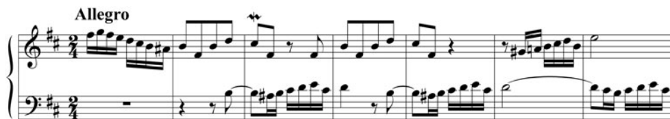
Example 2. Bach, 'Württemberg' Sonata No. 6 in B minor, Wq49/6/iii, bars 1–7

Brown provided a table that provisionally indicates the 'preferred instrument' and 'other possible instrument' for every solo and accompanied sonata. 12