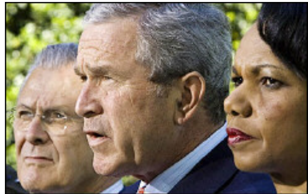
Former US Secretary of Defense Donald Rumsfeld, US President George W. Bush, US Secretary of State Condoleezza Rice

reality, many of the changes seemed to be determined largely by the Bush administration's urge to punish nations and domestic states that had not supported its efforts in Iraq and to reward those that had. Thus, within the United States, bases were being relocated to the South, to states with cultures, as the Christian Science Monitor put it, "more tied to martial traditions" than the Northeast, the northern Middle West, or the Pacific Coast. According to a North Carolina businessman gloating over his new customers, "The military is going where it is wanted and valued most."