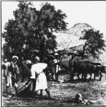
From Rediscovering Palestine