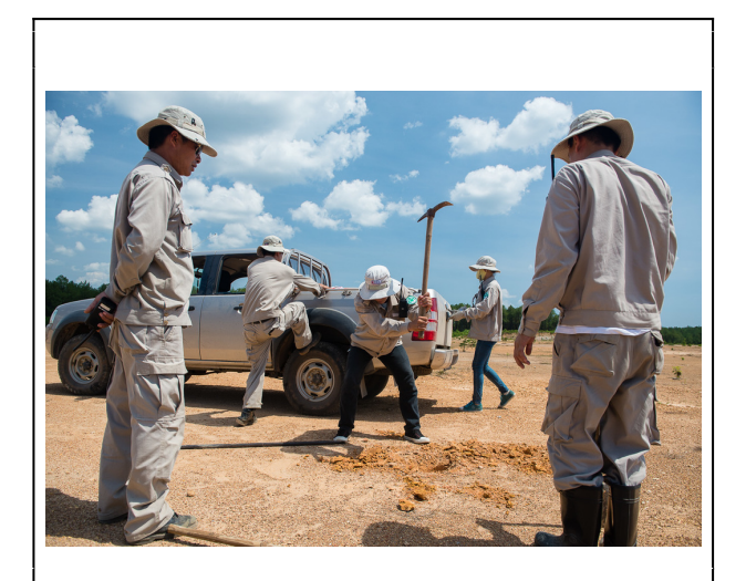
Quang Tri Province, Vietnam, 2013 - A Project RENEW EOD team digs a shallow trench to contain a controlled demolition of an artillery shell.

Project RENEW's work. NPA is a major partner of RENEW and, in addition to supporting the work in Quang Tri, also works in Thua Thien Hue Province further south. I came back to Vietnam in 2014 to spend a week near the ancient city of Hue and photograph NPA's work there.