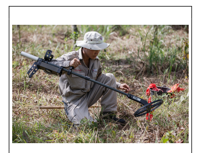
Quang Tri Province, Vietnam, 2013 - A member of the BAC team of Project RENEW uses a sensitive metal detector to investigate a suspected explosive from the war with the U.S. The item turned out to be only a metal fragment.

The final stage is the Battle Area Clearance (BAC), the systematic clearance of every square meter of the confirmed hazardous area using human deminers, detection dogs and drones. It is not unusual for survey work to be performed by one NGO and the clearance operations assigned to a different company or NGO. Discovered mines and UXOs are disposed of by EOD teams detonating them in a safe area with TNT. Sometimes the UXOs have to be destroyed on site rather than risk a detonation in transit; then the roads are blocked, team members warn the community via bullhorns, and unsuspecting water buffalo are led away from the danger zone before the explosives are triggered. Depending on the location of the ordnance, it can mean shutting down a national highway for an hour or more while the UXO is readied for destruction.