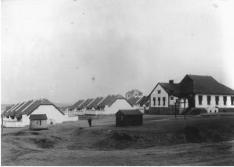
FIGURE 2. Settlement of Chinese Apprentices, at the big harbor in Qingdao (1910).