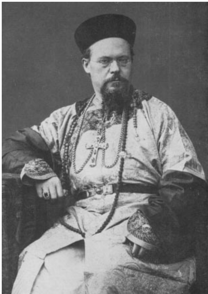
FIGURE 7. Bishop Anzer in Mandarin clothing (from Gründer 1982: fig. 33).