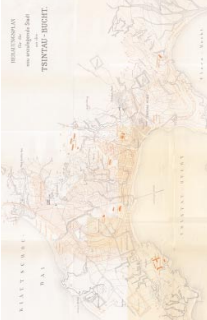
FIGURE 1. Construction plan for Qingdao, 1898, showing the superimposition of the street plan and buildings, in red, over the existing Chinese village ("Tsintau Dorf"), in black, and the buffer zone between the Chinese settlement ("Chinesen-Stadt Tapautau") and the city ("Tsintau Stadt") (from Denkschrift betreffend die Entwicklung von Kiautschou, 1898 , Anlage 2).