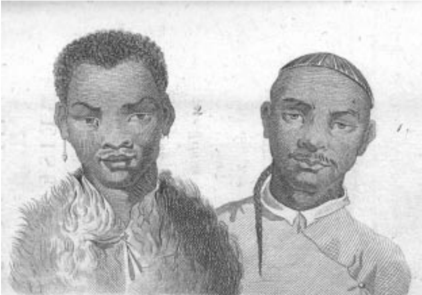
FIGURE 6. Illustration of Chinese and Khoikhoi faces from a German collection of travel narratives by Zimmermann (1810; adapted from Barrow 1805a: 52–53).

(1735) categorized the Chinese as Homo/Monstrous along with the “Hottentots,” who were seen by most Europeans as the epitome of debasement during the eighteenth century (Merians 1988). 104 During the nineteenth century the Chinese changed color from “white” to “yellow” in European perception (Demel 1992). Other writers focused on Chinese facial features or skull shape. Following a standard line of comparison in the Cape Colony, John Barrow suggested physical similarities between the Chinese and the Khoikhoi, moving from there to speculations about their shared origins (1801, Vol. 1:277–83). 105 A German discussion of Barrow included an engraving of Chinese and Khoikhoi faces (Figure 6).