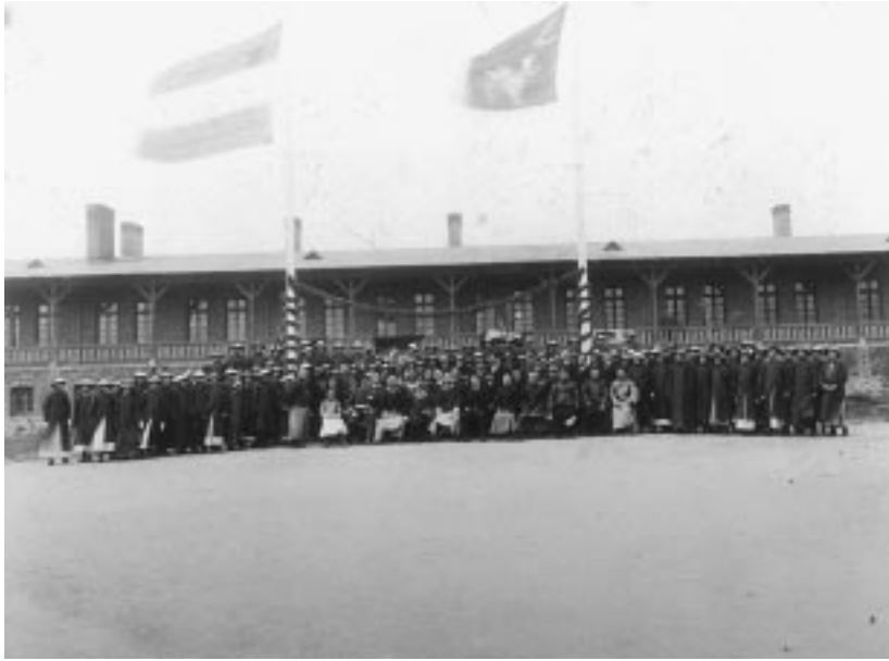
FIGURE 5. Staff and students in front of German-Chinese College, showing flags of Imperial Germany (left) and late Qing Dynasty (1910/1911). (BArch Freiburg, Nachlass Truppel, vol. 81, p. 1).

into the dominant pole of the racial/anthropological binary and placed on the same cultural level as the colonizer. The Imperial German and late Qing dynasty flags flew alongside one another in front of the school (Figure 5). 97