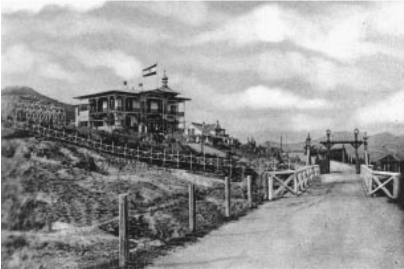
FIGURE 4. Governor’s Mansion, Qingdao (ca. 1910) ( Ansichten von Tsingtau und dem Hinterlande (n.p.: n.d., ca. 1910).

curriculum of Chinese and German subjects, including Chinese language and classics and “Western” sciences like physics and chemistry. Religious teaching, which in this context meant European religion, was banned at the Qingdao College—a significant gesture of cultural reconciliation, in light of the centuries of conflict surrounding Christian missionaries in China, culminating most recently in the Boxer rebellion. The colony’s annual report for 1907/08 noted that “the Chinese government has insisted on a parallel Chinese track and curriculum” alongside the German one, commenting that “we agree with their concern that young people not lose touch with their own literature and culture.” According to the report, “the young men should be educated to love their fatherland . . . but also to appreciate German culture and to develop their country according to these values.” 96 Otto Franke insisted that the goal was not to transform the students into Germans or “characterless cultural hermaphrodites” (1911b:204). At the school’s opening ceremony in 1909, speakers from both sides endorsed the idea of combining the best of Chinese and European/German culture. A toast was raised to the Chinese Emperor, the Chinese national anthem was sung, and the school’s German director proclaimed that “all of the cultural peoples ( Kulturvölker ) are linked by a common bond,” and should “share their discoveries.” Here the Chinese were unambiguously (re)inscribed