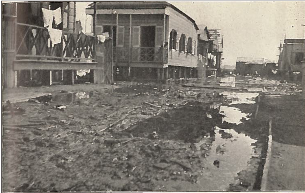
A street during high tide in one of the land rent sections of Puerta de Tierra.