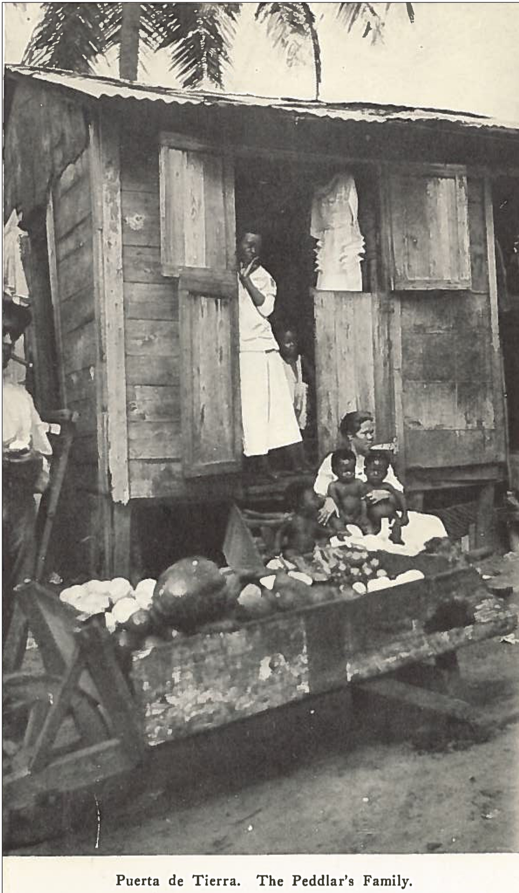
Puerta de Tierra. The Peddlar's Family.