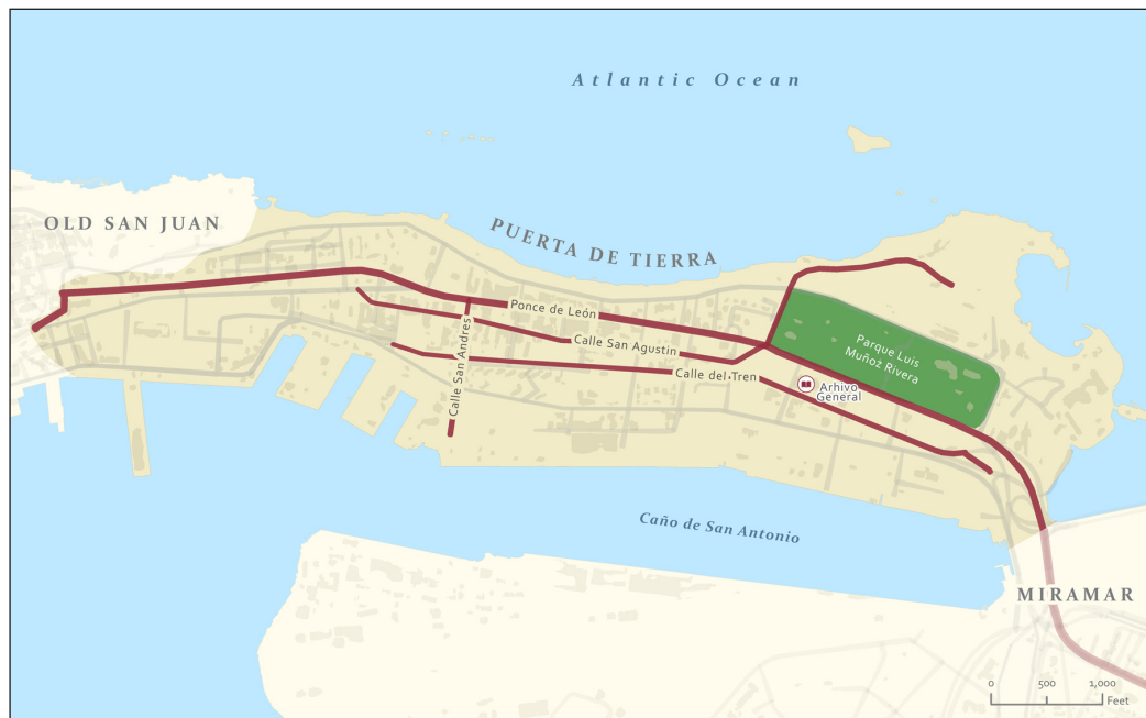
Figure 1: Map of Puerta de Tierra. Prepared by Tracy Tien, Post-Baccalaureate Spatial Fellow, Spatial Analysis Lab, Smith College.

neighborhood from the rest of the city. 7 The docks and warehouses of Puerta de Tierra sat squarely between San Juan and the rest of the island. San Juan was the center of the government, and many US and Puerto Rican officials and elite families lived there. Residents of San Juan could not leave the isleta to reach the rest of the island without crossing Puerta de Tierra.