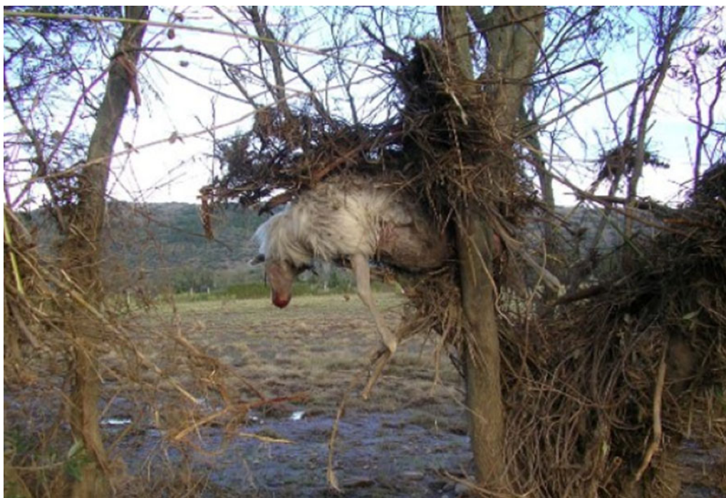
Figure 1. Sheep washed by the flood on a tree, north-eastern part of Sardinia Island (Italy), November 2013.

in India where a cloud of methyl isothiocyanate gas leaking from the Union Carbide pesticide plant killed about 10 000 people in Bhopal during the first three days. The disaster was blamed as the 'genocide of the poor'. The tragic event prompted an animated debate among Italian parasitologists within the SoIPa, with colleagues sustaining the likelihood that this chemical soil pollution may impact on a wide range of organisms including parasitic forms present in pastures. Since the compound methyl isothiocyanate is a pesticide active on insect as well as nematode pests, its presence in the soil may modify the epidemiology of parasitic Diptera causing myiasis and of gastrointestinal nematodes species. Also in this case it would have been important to conduct studies on contamination effects not only in proximity of the plant but also in adjacent areas