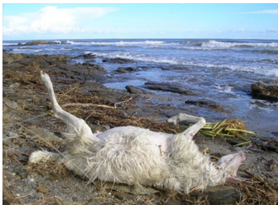
Figure 2. Sheep washed by the flood up to the sea, north-eastern part of Sardinia Island (Italy), November 2013.

Considering the impact on ecosystems, fires consume not only the vegetation but also affect the upper soil layer where many parasites spend part of their life cycle, thus reducing habitat availability, with consequent potential benefits for the hosts (Álvarez-Ruiz et al. , 2021). As reviewed by Scasta (2015), North American