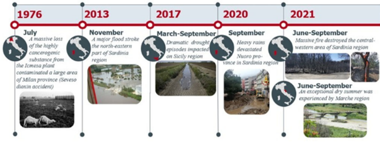
Figure 4. The timeline of Italian disaster examples, affecting the parasite environmental habitats, their survival and capacity to propagate.