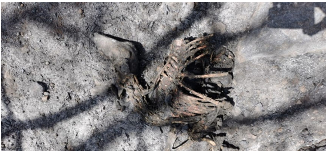
Figure 3. Carbonized sheep in the area of Montiferru (central-western area of Sardinia), after the fire in summer 2021.

Therefore, to contain fires and mitigate their effects, it is most important to adopt at farm level preventive measures such as: improve the structure of fences including escape routes for animals; secure sheds (primarily barns); create water points; provide viability in every direction and part of the farm; provide food supply for animals (Camarda and Vacca, 2021). In addition, the promotion of silvopastoralism as a wildfire prevention strategy should be considered (Nuss-Girona et al. , 2022). According to the local forest characteristics and type of breeding practiced in the area, various ruminant species might be employed (Nuss-Girona et al. , 2022). In this context, also the grazing of horses has been found effective in controlling easily combustible underwood vegetation in an area of Spain (Rigueiro et al. , 2002). Other Iberian