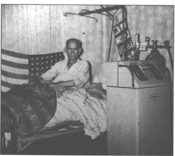
Illustration from Black Lung