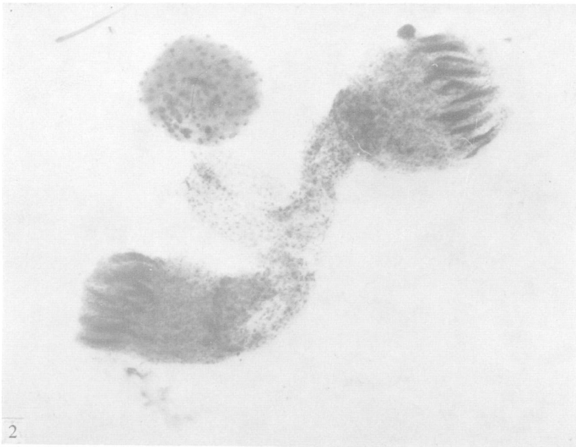
Fig. 1. A, pair of normal ovaries from 4-day-old female ( 31.1/dp\ b\ cn\ bw; ve/+ ) coming from cross 2 (Table 1) and B, pair of atrophic ovaries from 4-day-old female ( 31.1/dp\ b\ cn\ bw; ve/+ ) coming from cross 1 (Table 1) (magnification \times 50 ).