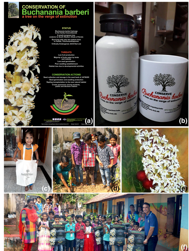
Conservation and education campaign for Buchanania barberi : (a) poster, (b) water bottle and mug, (c) bag, (d) seedling planting, (e) painting by Reema Abraham, (f) school awareness campaign.

Jawaharlal Nehru Tropical Botanic Garden and Research Institute has received funding from the Mohamed Bin Zayed Species Conservation Fund, UAE, to conserve B. barberi . In March 2022 and February 2023, we conducted education campaigns about the species, engaging key stakeholders such as the Forest Range Office in Palode, the Kerala Forest Department in Thiruvananthapuram, three schools (Government high school, Jawahar Colony; Upper primary school, Karimancode; Government lower primary school, Karimancode), and the local communities