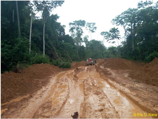
Cameroon government once more opens way for logging in the biodiversity rich Ebo Forest, a Key Biodiversity and Tropical Important Plant Area.

work because there are no law enforcement agents present to prevent large-scale poaching facilitated by logging. It is not a priority for logging companies. The management strategy of Conservation Enclaves within Forest Management Units needs revamping. We fear therefore that this decision will lead to extirpation of threatened and rare species such as Preuss's red colobus Ptilocolobus preussi (with only two remaining populations, one of which is in the Ebo forest), the Goliath frog Conraua goliath (the largest living frog), the culturally unique Nigeria–Cameroon chimpanzee Pan troglodytes ellioti (which both fishes for termites and cracks nuts), and a potential new subspecies of gorilla occurring between the western lowland gorilla Gorilla gorilla gorilla and Cross River gorilla Gorilla gorilla diehli . One hundred and fifty-six threatened and 14 new plant species have been recorded in this forest since 2004 by the Royal Botanic Gardens, Kew and the National Herbarium of Cameroon.