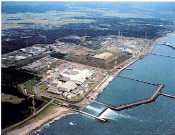
The Kashiwazaki-Kariwa plant

That would have been a catastrophic event where the damaging effects of the quake itself and radiation leaked from the plant reinforced each other.