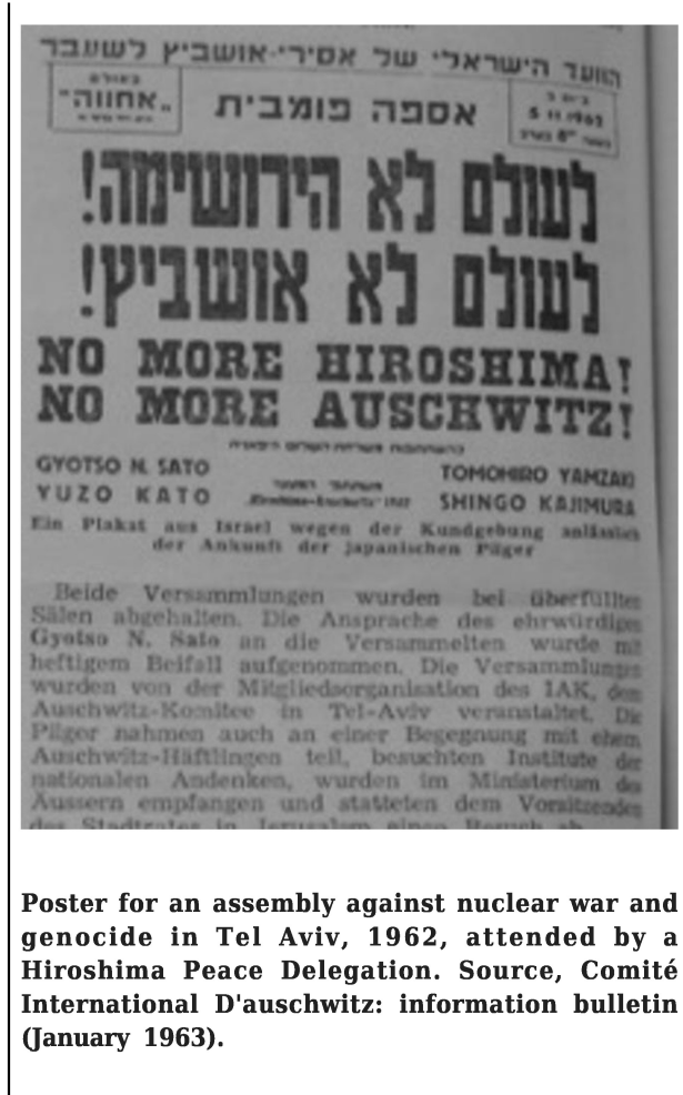
Poster for an assembly against nuclear war and genocide in Tel Aviv, 1962, attended by a Hiroshima Peace Delegation.

As I demonstrated in greater detail in my manuscript Hiroshima: the Origins of Global Memory Culture , perhaps the most prominent of these developments was the emergence of the idea of the survivor and a culture of testimony that drew on disparate sources, both within and outside the Cold War West. 6 In both communities (and, indeed, many others from Beijing to Vienna) the story told after the war was of a journey from darkness into light, of the nation emerging from the crucible of defeat and victimization to achieve resurrection and national strength. Whether it was the founding of Israel or the reemergence of Japan as a pacifist nation, the recent tragic past was immediately conscripted in service of the present. This journey from victimhood to resurrection was inscribed, literally in stone, in both Hiroshima’s and Jerusalem’s main monuments. 7