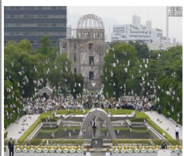
The August 6 Ceremony, Hiroshima. Notice the Axis leading from the Dome through the Cenotaph and into the place of the photographer (on top of the museum building).