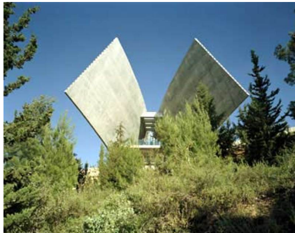
The Yad Vashem Memorial.

emphasizes Japan's own victimization. Challenges to this narrative by progressive educators are often met with vehement opposition from the right. The memorial itself, as the kagaisha kōna issue demonstrated, did not escape such controversy. In Israel, as Amos Goldberg pointed out, the Yad Vashem memorial encourages a very particular Zionist reading of the Holocaust and blocks more nuanced understandings of the tragedy. 56 Holocaust education is a significant portion of patriotic education in Israel and it privileges the accepted national notions of sacrifice and resurrection. Despite decades of criticism and challenges - including from within the establishment, memorial days, commemoration sites and organized school trips to the site of European camps, still privilege a national, even nationalist reading of the past.