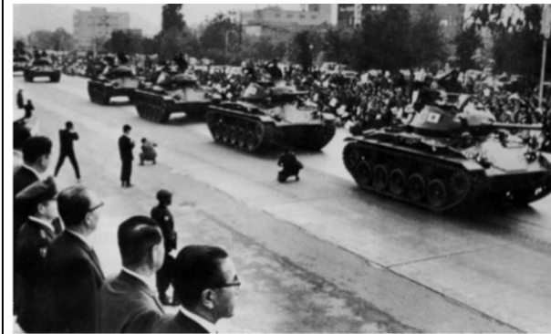
The Japanese Defense Forces’ 13 th Division tanks parading down Peace Boulevard, Hiroshima 1965

With the Vietnam War and the new peace movement, another generation challenged this view of Japanese as victims. This is demonstrated by the work of the novelist and activist Oda Makoto. Oda was the leader of Beheiren ( Betonamu ni heiwa o shimin rengo — Citizen’s League for Peace in Vietnam) and was one of the first major public figures to confront the fallacy of Japanese victim consciousness and to insist that it blinded the Japanese to their own responsibility for past (and present) crimes of war. The Vietnam War revealed Japan’s complicity in contemporary aggression on the continent. Beheiren and other student and citizen groups vehemently opposed blanketing these historical and political realities under the usual abstractions. Oda and other activists directly challenged Japan’s victim narrative. When the ruling LDP endorsed anti-nuclearism with the three non-nuclear principles (while covertly colluding with America over breaking these very principles) and for the first time sent Prime Minister Sato Eisaku to Hiroshima, the students stormed the ceremony and fought a pitched battle with the Hiroshima police.