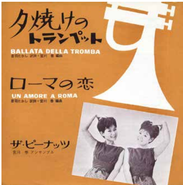
Fig. 1: Jacket covers of various 45 rpm singles released by The Peanuts

The Peanuts’ ties to Western Europe went beyond simple cover songs and linguistic citations. The duo frequently visited Europe to perform concerts, appear on television, and to undertake recording sessions. 14 They formed collaborative relations with a number of European musicians, most notably the Italian-French singer Caterina Valente. 15 The Peanuts released recordings on the continental market and apparently reached a fair degree of popularity, especially in West Germany and Italy, where they performed live and starred in television specials. They aimed their 1965 recording “Heut’ Abend” (released under the moniker Die Peanuts) at the West German market, mixing Japanese and German lyrics in a playful manner that embodied the fluid cosmopolitanism of their image. A 1965 Japanese magazine article reported that Watanabe Productions intended the duo to become global stars like film actor Mifune