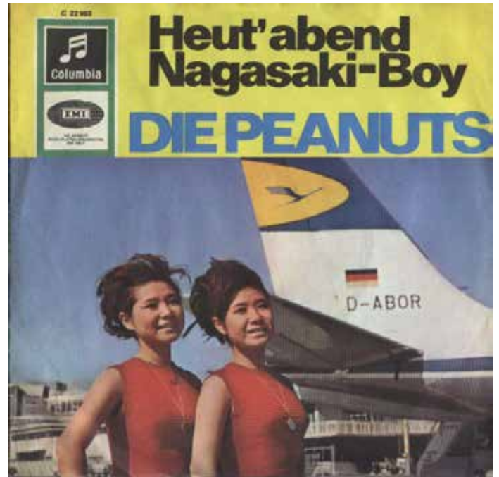
Fig. 2, 45 rpm single jacket for Die Peanuts, “Heut’ Abend” (Columbia Records Germany, 1965)

Toshirō and described their domestic fans as feeling a bit like Spencer Tracy in Father of the Bride , watching their little girls grow up and leave home. 16