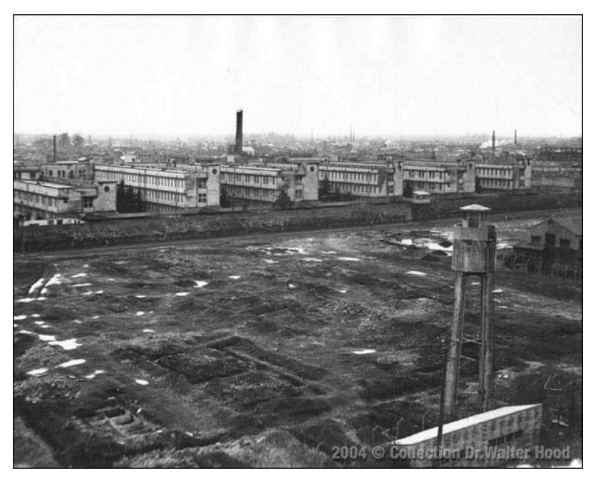
Sugamo Prison, 1947

The mitigation of the sentences of war criminals and the agitations for parole symbolized the popular reaction to the Tokyo War Crimes Tribunal. After the Peace Treaty went into effect, 'Sugamo Prison' had its name changed to Sugamo Detention Centre. Utsumi Aiko from Keisen University points out that "the parole-for-war-criminals movement was driven by two groups: those from outside who had 'a sense of pity' for the prisoners; and the war criminals themselves who called for their own release as part of an anti-war peace movement. The movement that arose out of 'a sense of pity' demanded 'just set them free (tonikaku shakuho o) regardless of how it is done'. The situation heated up to such an extent that expressions like 'if you are Japanese, sign!' became a catch phrase."