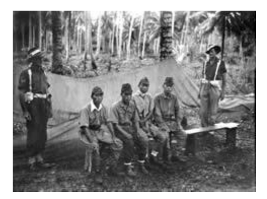
Four Japanese officers await trial for war crimes at Labuan Island, December 1945.

This trend amounted to forgetting about Article 11 of the San Francisco Peace Treaty in which Japan accepted the verdicts of the Tokyo Tribunal and the B and C level tribunals.