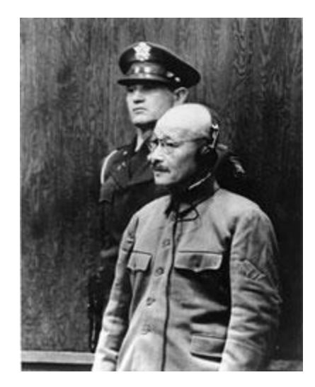
Tojo Hideki awaits sentencing, Movember 24, 1948.

The Home Affairs Ministry compiled a report on popular reactions from each region, but recorded the overall situation as follows: "Regarding General Tojo's decision to commit suicide, those completely sympathetic to the timing, method, and attitude shown in the suicide are exceedingly rare, and most people are thoroughly critical and reproving. The main reactions are as follows: