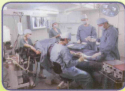
NorBase single and expandable containers