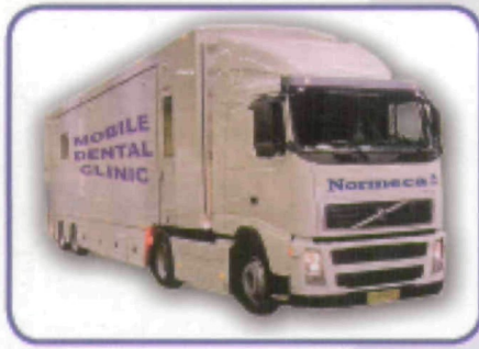
All kinds of clinics or hospitals in MultiSpace