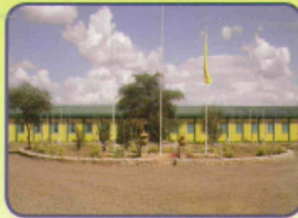
KATIKO Referral Hospital, Southern Sudan