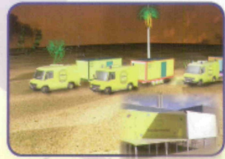
All kinds of Mobile Clinics