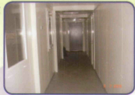
Inside MSF Hospital in Hattian Bala

Number One in the world within partly and turn key solutions incl. Transportation, Erection, Management, Training, Maintenance, Education, Administration, Storage, Out sourcing, Medivac, etc.