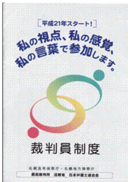
"The Lay Assessor System: Participating with My Opinions, My Sentiments, and My Words" -- cover of undated Supreme Court pamphlet for public distribution, 2006.

On May 21, 2009, lay citizens will join professional judges in deciding the fate of suspects of major crimes in Japan's new saiban-