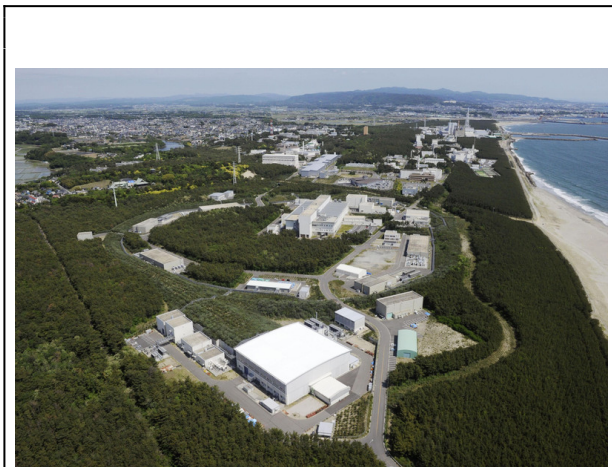
Tōkai nuclear power plants

MURAKAMI: Exactly. I saw this tendency more and more, and felt uncomfortable with it.