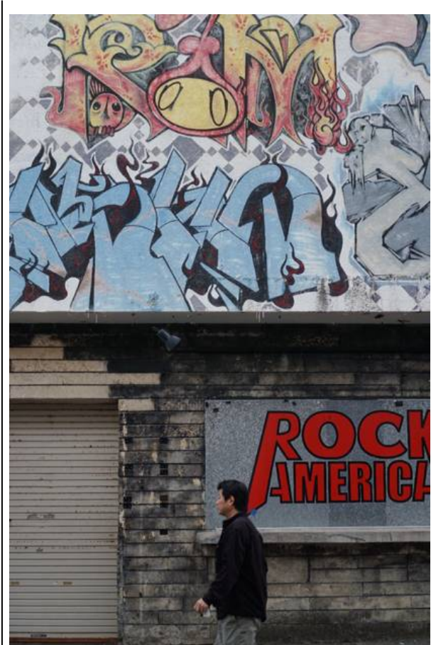
Entertainment district outside a U.S. military base in Kin, Okinawa, 2017