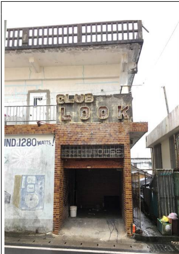
Entertainment district outside a U.S.