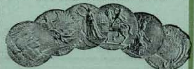
Gold Medal (Highest Award), Allahabad 1910.

GRANDS PRIX: Paris 1900, Brussels 1910, Buenos Aires 1910