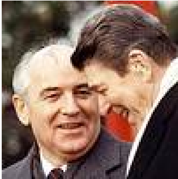
Reagan and Gorbachev

New York Times recently asserting that the US-Russian relationship today "is far better than it was 15 years ago.")