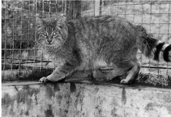
Plate 1 A Chinese mountain cat Felis bieti kept at the Wildlife Rescue Center, Xining, China.

individuals, and assessing the accuracy of each bibliographic or verbal record.