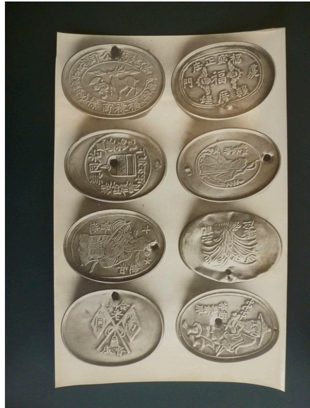
Figure 3: Opium Tins from China Confiscated in the Netherlands Indies, 1930.

An unintended consequence of this confluence of policies across neighboring regimes was the empowerment of a wealthy and savvy transnational opium investment network. Over the 1860s, 1870s, and 1880s, intense competition raged across southern China and Southeast Asia between the same groups of opium investors, as they either took over state tax farms or slipped into smuggling when the contracts were awarded elsewhere. These were also the decades during which opium cultivation expanded most rapidly across the Qing Empire, producing by the 1880s tens of millions of chests of the drug each year.