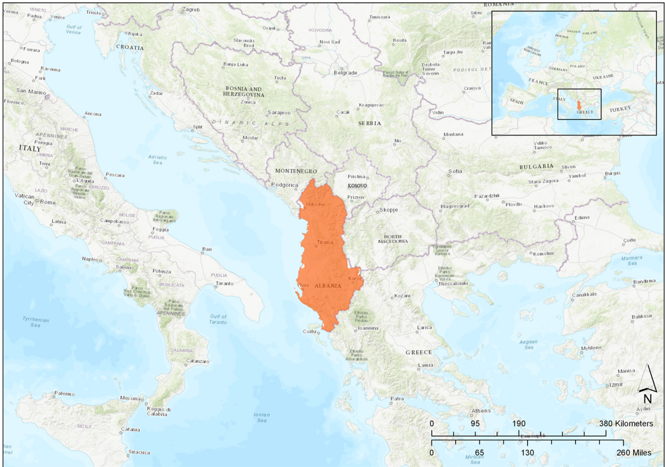
FIGURE 1. Map of Albania and the Balkans.

relationships, changing boundaries, and economic underdevelopment compared to neighboring central and western Europe (Abrahams 2015; Vickers 2001).