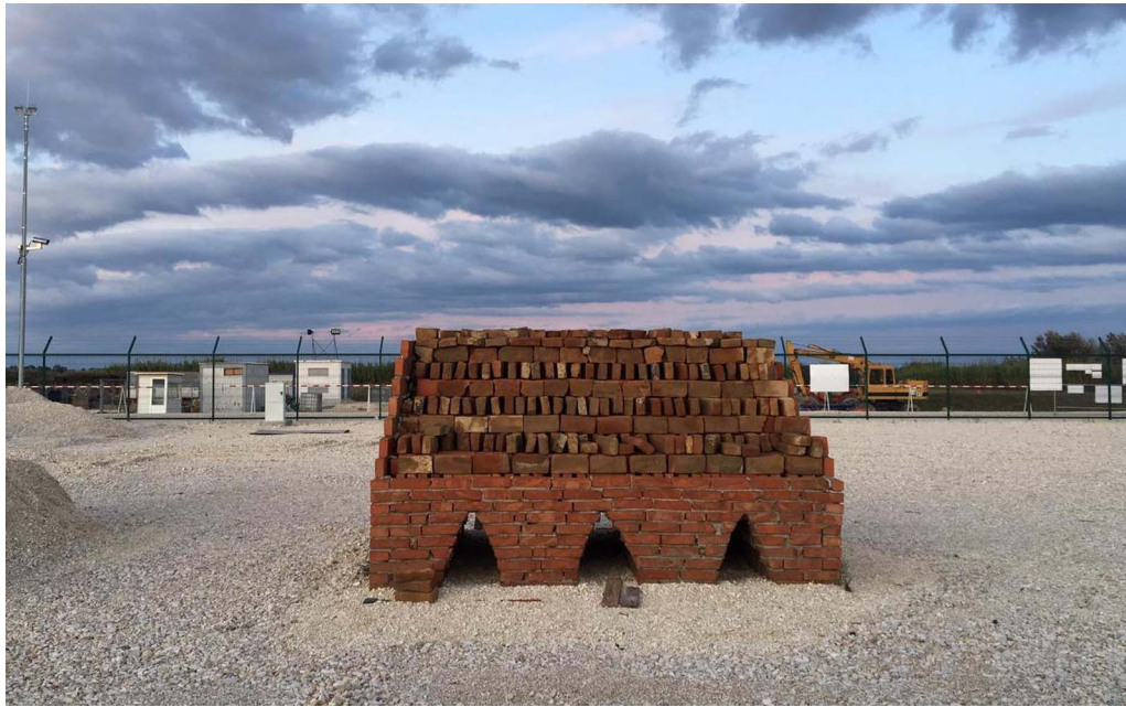
FIGURE 6. Reconstruction of a twentieth-century brick kiln from the site of the TAP compressor station in Fier (western Albania).

government policies in the energy sector, which seek, on one side, to stimulate the production of energy from renewable resources, and on the other, to provide a local solution to the growing internal demand for energy consumption. As a result of these developments, almost every governmental agency is faced with an unusually large number of requests for approvals of projects that intend to use, eventually, the running water of every stream, large or small, everywhere in the country. Central cultural heritage institutions face the same pressure for approving cultural heritage impact assessment reports required by planning authorities, alongside approvals of Environmental and Social Impact Assessments. The National Archaeology Council expresses discontent with the systematic spread of this kind of project almost everywhere, fearing a diffused impact on the ecosystems (even though the environmental agencies have always approved the projects) and on the natural and cultural landscapes, often in areas where no other projects could be developed. Nevertheless, there is no legal basis for the National Archaeology Council to not approve projects that are legally compliant and in remote areas with no direct impact on archaeological or cultural heritage resources. In fact, until the very recent Law on Cultural Heritage and Museums of 2018, the concept of cultural landscape was not present in the legislation, providing no effective arguments against these projects.