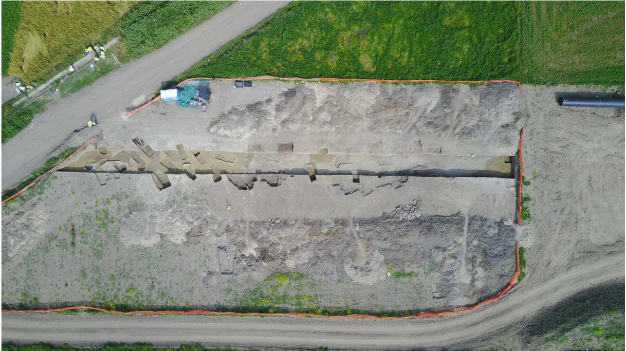
FIGURE 3. View of the excavation of the trench line (5 m wide) at the cemetery of Turan in the Korça area (southeastern Albania). The fenced area with the orange mesh is a segment of the TAP's right-of-way (48 m wide).