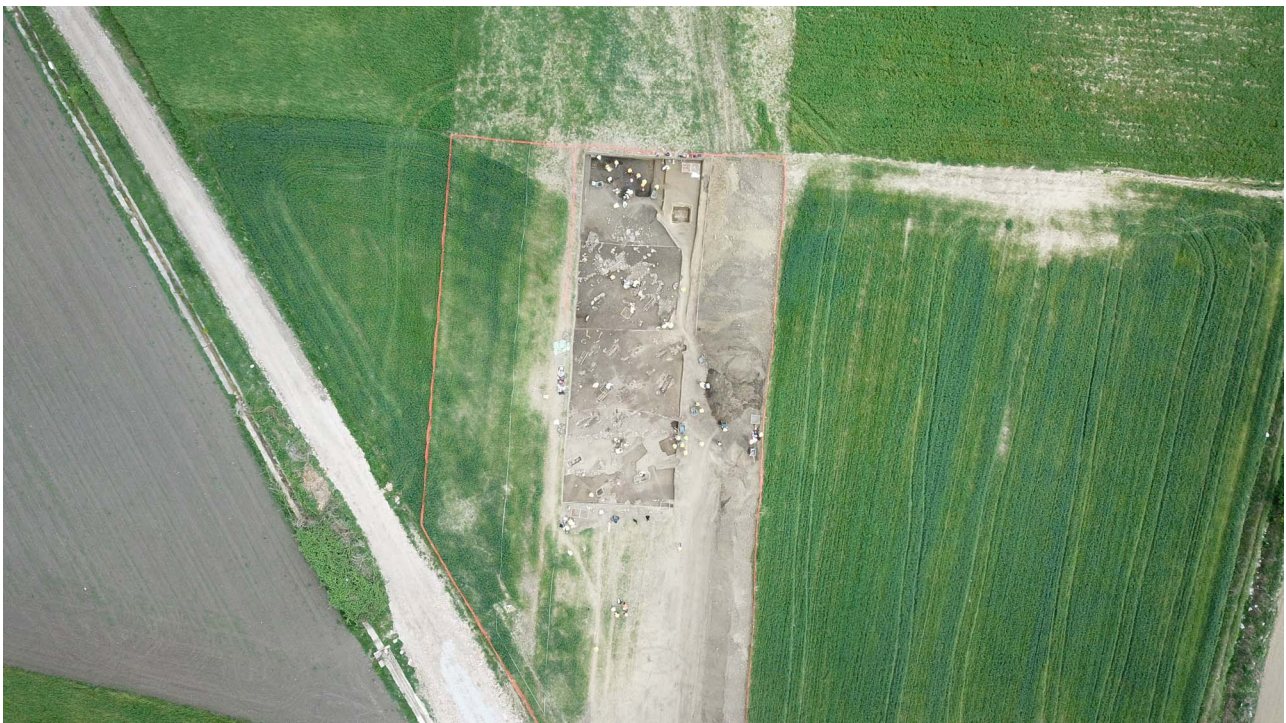
FIGURE 4. View of the excavation of the right-of-way (fenced area with orange mesh 48 m wide) of the TAP project (trench line is backfilled) at the cemetery of Turan in the Korça area (southeastern Albania).