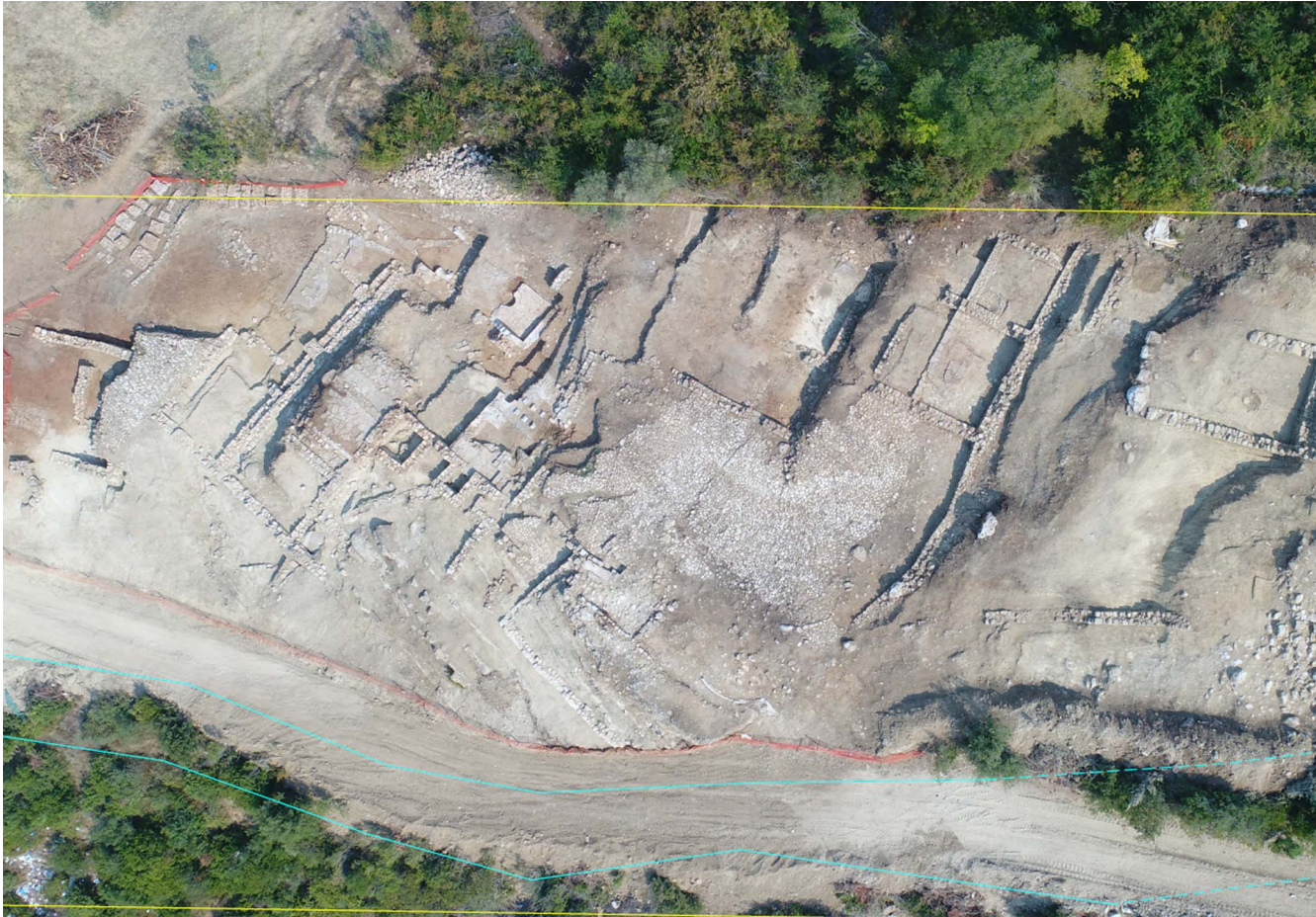
FIGURE 5. Aerial view of the site at Fushë-Peshtan, Berat District (central Albania). Yellow lines indicate the right-of-way (48 m wide), whereas the blue lines show the rerouted trench for the gas pipes (approximately 8 m wide).

reinstated the area with the addition of erosion control measures carried out carefully by TAP.