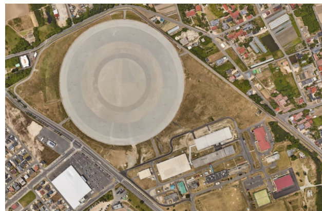
DFS surveillance facilities in Higashi Chitose (top left/top), Tachiarai (top right/second), Kofunato (bottom left/third), and Miho (bottom right/fourth).

About 700 miles southwest of Tokyo, there are two small towns called Tachiarai and Chikuzen, which have a combined population of about 44,000 people. Japan’s military, known as the Self-Defense Forces, has a base situated on a patch of grassy farmland in between the towns. But the base is not used to train soldiers. It is one of the country’s most important spy hubs. For years, the large antennae inside the secure compound, which are concealed underneath what look like giant golf balls, attracted concerns from local residents who were worried that the powerful radio waves they emitted might damage their health or interfere with their televisions. The Japanese government sent senior officials to reassure the locals that there would be no problems, and the