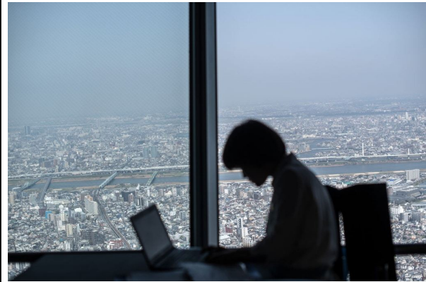
A woman works on her laptop on the viewing platform of the Tokyo Skytree on March 29, 2018, in Tokyo, Japan.

A spokesperson for Japan’s Ministry of Defense refused to discuss MALLARD, but said that the country’s “information-gathering activities” are necessary for national security and “done in compliance with laws and regulations.” The spokesperson acknowledged that Japan has “offices throughout the country” that are intercepting communications; however, he insisted that the surveillance is focused on military activities and “cyberthreats” and is “not collecting the general public’s information.” When pressed to explain how the country’s spy systems distinguish ordinary people’s communications from those related to threats, the spokesperson would not provide details on the grounds that doing so “may be a hindrance to effective future information activities.”