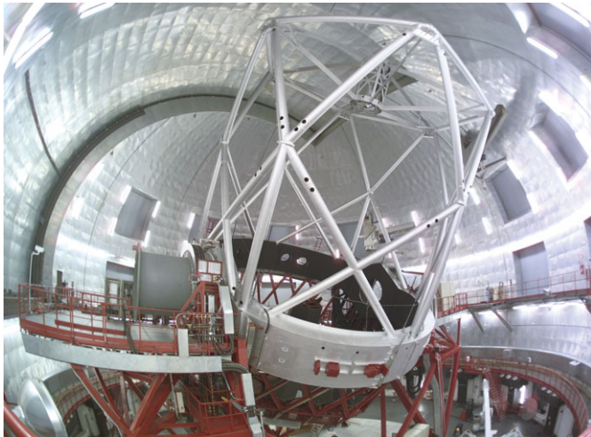
Figure 2. The GTC telescope.

The GTC Project is a Spanish initiative led by the Instituto de Astrofísica de Canarias (IAC). It is located in one of the top astronomical sites in the Northern Hemisphere, the Observatorio del Roque de los Muchachos (ORM, La Palma, Canary Islands). Works began in late 1999. The First Light event took place on July 2007. Its first science is expected for 2009. The cost of construction and administration formalities is around 130 M€. The project is actively supported by the Spanish Government and the Local Government from the Canary Islands through the European Funds for Regional Development (FEDER) provided by the European Union. The project also includes the participation of institutions from Mexico and the USA. Mexico's National Institute for Astrophysics, Optics and Electronics (INAOE), and the Institute of Astronomy of the National Autonomous University of Mexico (IA-UNAM), contribute with 5% of the project's construction, running and start-up costs. The agreement also sees the GTC exchanging observing time with the Large Millimetre Telescope (LMT), a 50 m telescope built by the INAOE and the University of Massachusetts. From the USA, the University of Florida Research Foundation signed an agreement under which it will contribute 5% of the project's cost in return for 5% of the observing time. The Mexican institutions and the University of Florida are also developing some of the telescope's instruments.