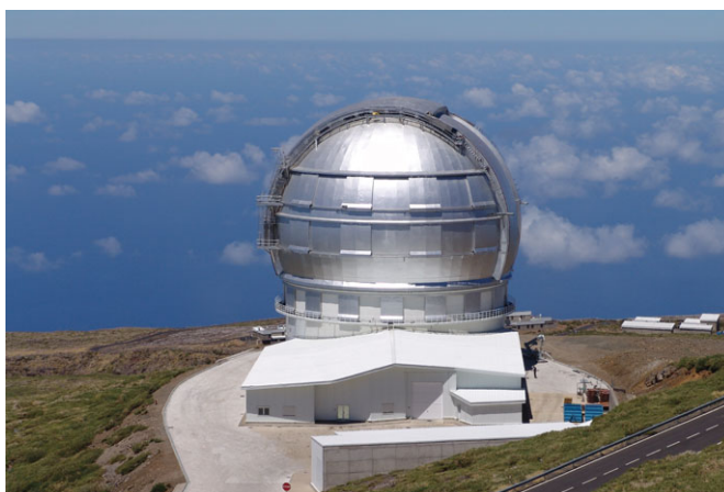
Figure 1. GTC's dome and building.

2009 is important for Astronomy in Spain, not just because of the celebration of the International Year of Astronomy, but because the beginning of the operation of the Gran Telescopio CANARIAS, the GTC. The GTC is a reflecting telescope designed to incorporate the most up-to-date technology and, when it enters service, it will be one of the most advanced telescopes in the world. The GTC will 'see' the farthest, faintest objects in our Universe. This is like travelling through time –the light that reaches us from the remotest objects in the Universe started its journey some 13,000 million years ago. This light will help to provide answers to many questions about how the known Universe was formed and how it evolved.