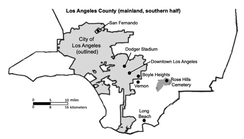
Figure 2. An enlargement of the Los Angeles Metropolitan area. Sites mentioned in article are indicated.

perspective of having grown up in a working-class community in Syracuse, New York, where we were one of the only Mexican American families in the region.<sup>2</sup> For the last fifteen years, I have been an active mariachi musician in Southern California, as well as across the United States and Latin America. My current role as a tenured professor of ethnomusicology at a state university now places me in the middle class; however, I often