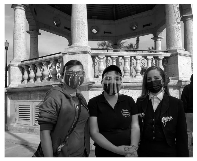
Figure 4. Members of Mariachi Lindas Mexicanas pose in front of the Mariachi Plaza kiosk after distributing care packages in Boyle Heights, 5 January 2021.