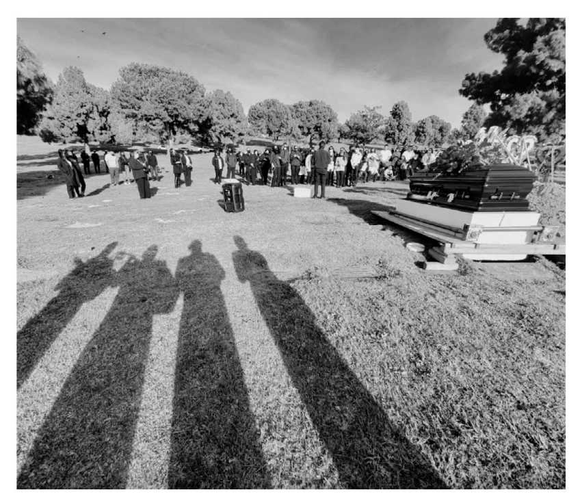
Figure 5. Shadows of Mariachi Lindas Mexicanas members stretch over the grass at a funeral in Resurrection Catholic Cemetery in Rosemead, CA, 15 February 2021.

families who struggled to afford or find an available mariachi. The collective grief and desperation we observed was immense. The congested cemeteries had a strikingly frenetic energy; the grounds were blanketed with flowers, photographs, service tents, and chequered mounds of new graves; between them flowed a steady procession of mourners, musicians, cars, broadcast news vans, and grave-digging machines.