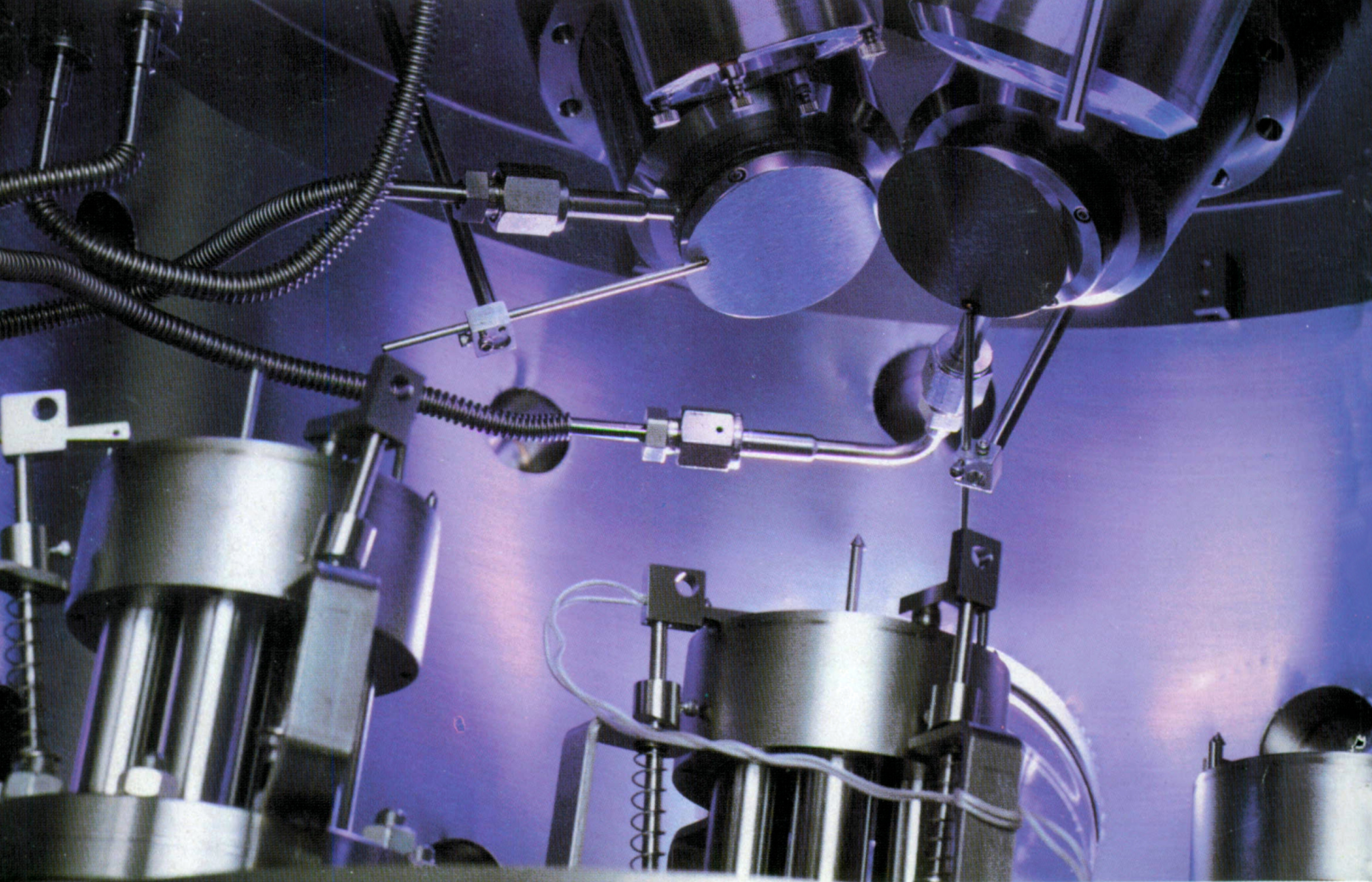
▲ A typical UHV internal arrangement for co-sputtering.