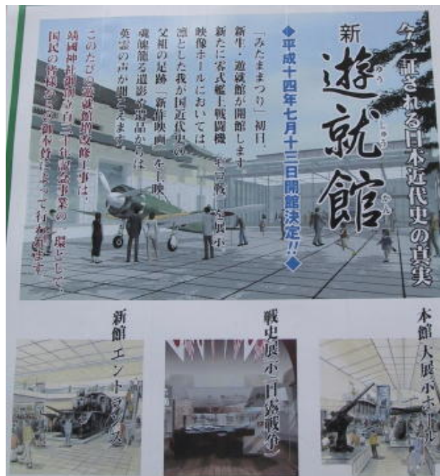
Yushukan war history exhibits at Yasukuni Shrine

restore the reputations of two Japanese officers who, in 1937, were reported to have engaged in a contest to see who could kill more Chinese in what came to be known as the 100-man beheading contest. The divisions are not only those between nations. They are also played out within Japan. Since its foundation in 1984, the Research Committee on the Nanjing Incident (Nankin jiken chosa kenkyukai) has published in-depth studies documenting the atrocities in Nanjing. In contrast, the Japan Association for “Nanjing” Studies (Nihon “Nankin” gakkai) has zealously published revisionist accounts denying the NM since its founding in 2000.